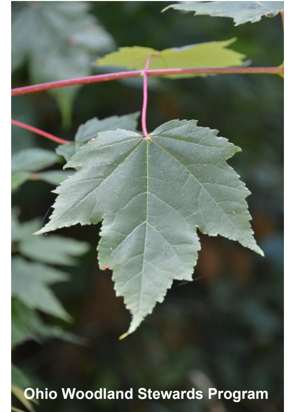
Ohio Woodland Stewards Program