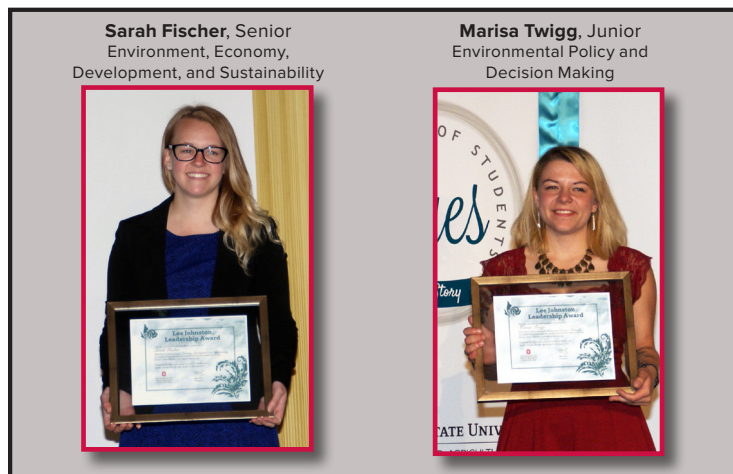
Congratulations to this year's Lee Johnston Award winners!

Two awards were presented at the 2017 College of Food, Agriculture, and Environmental Sciences annual Recognition Banquet. This year's banquet was held on April 6 th in the Archie M. Griffin Ballroom of the Union. The theme of the banquet this year was "Our Story". Each student awardee received a certificate of recognition and a $500 scholarship award.