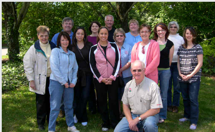
2008 SENR staff retreat to Dawes Arboretum.