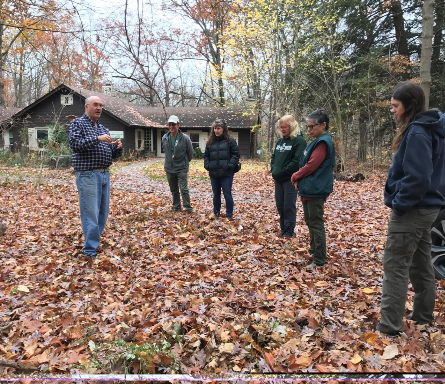
2022 Site Visit to Spruce Run Nature Center