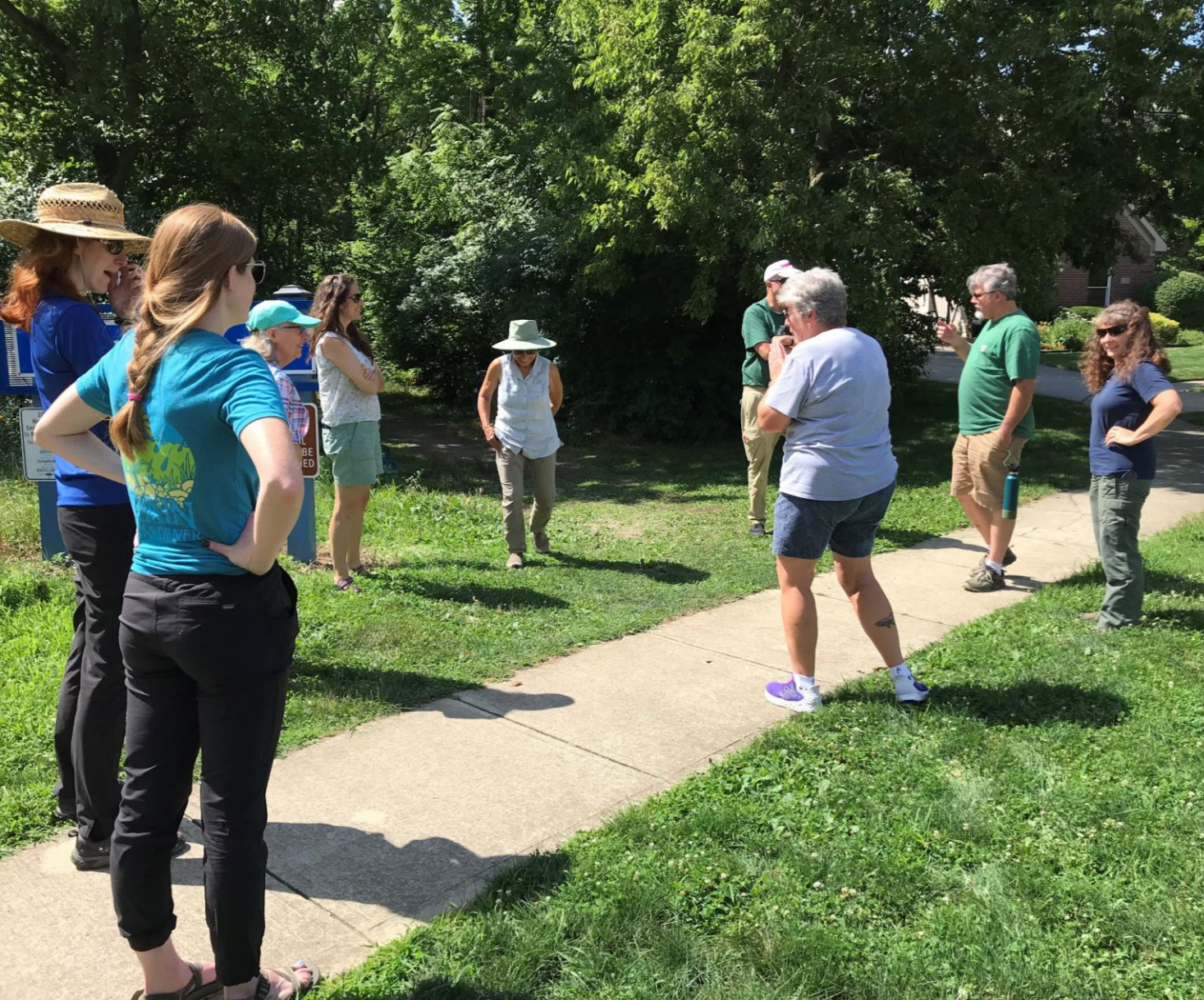
2022 Site Visit to Scioto Run Nature Trail