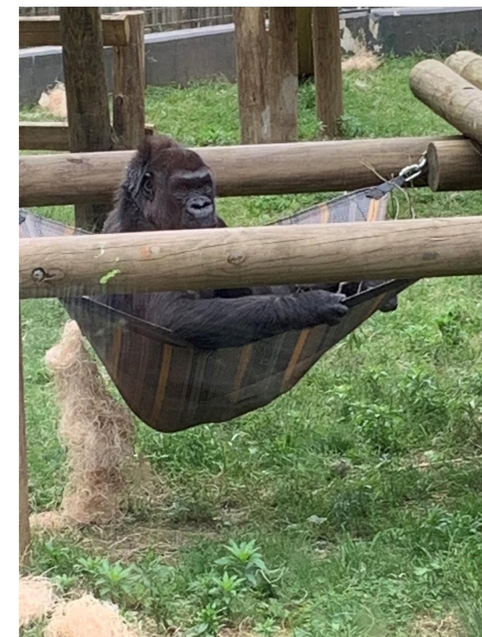
Nia, The Gorilla

Nia would like to sit in the bed in the outdoor enclosure, and she was always aware when I was watching her.