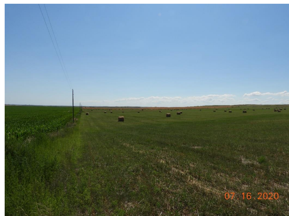
We used topography to determine where the well and pipeline system should be placed.