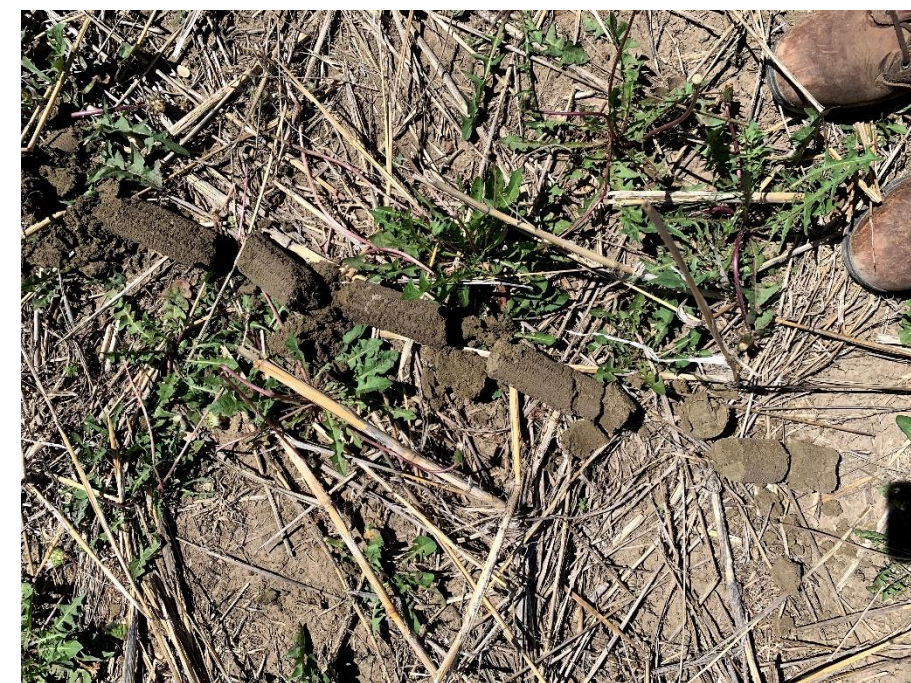
Soil core used to aid in decision making

Most of my time was spent doing soil site investigations. I went out with a resource soil scientist to look at various sites and used our soil expertise to make decisions such as, determine if an engineering practice could be used, what cover crops to use, or what species of trees to plant in a windbreak.