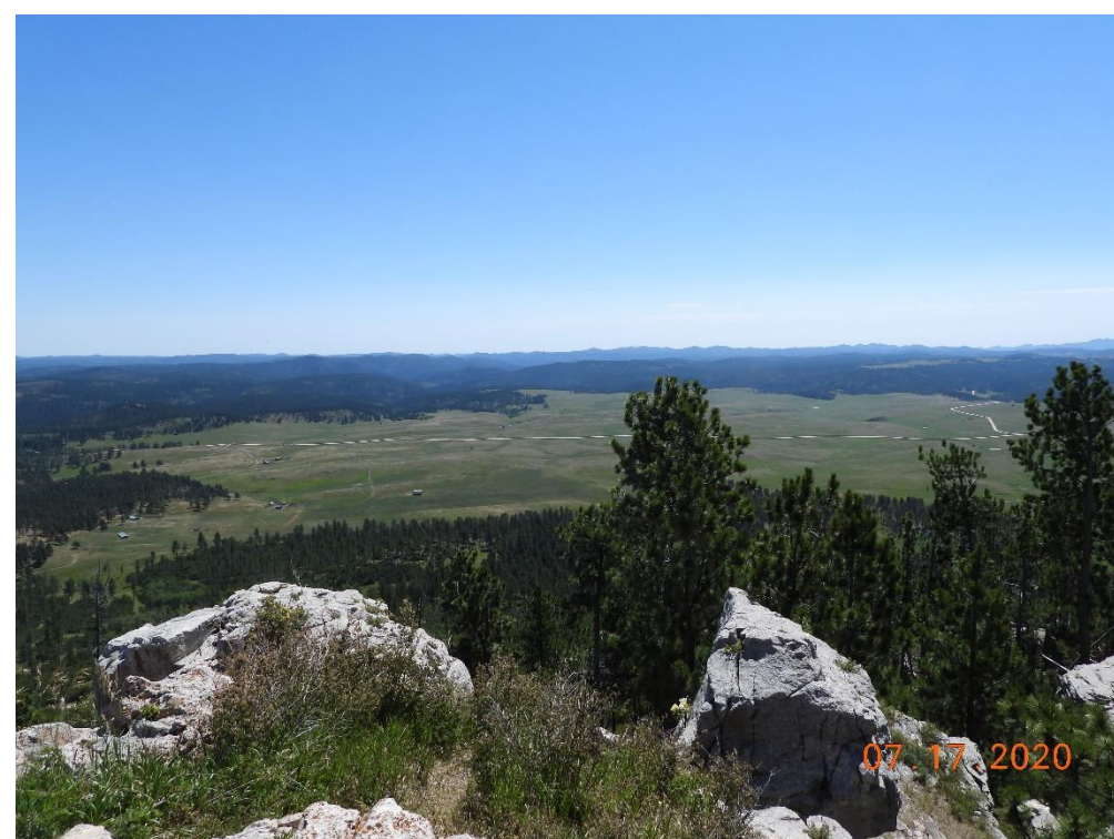
Lookout point in the Black Hills

NRCS is a federal agency under USDA. They facilitate programs that incentivize farmers and ranchers to do conservation agricultural practices such as cover crops, rotational grazing, and filter strips. There is typically an office in every county throughout the country.