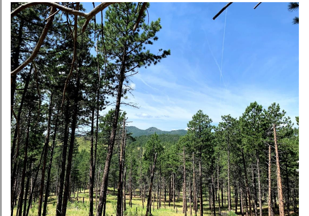
Black Hills National Forest