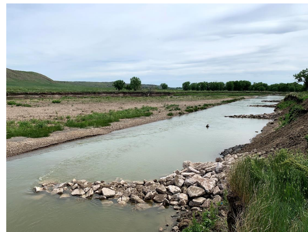
A completed set of stream barbs that I staked out.

I worked with the engineers quite a bit. I used a Trimble GPS system to survey potential construction sites such as dams, stream crossings, and evaporation ponds. I designed a solar pump system and steel fabricated windbreaks according to NRCS specifications.