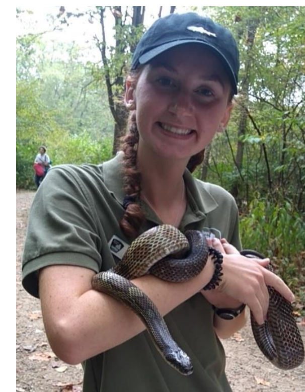
Roving the Trails with our Animal Ambassador, a Grey Rat Snake