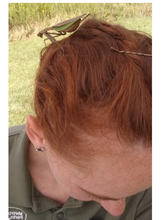
Bugstravoganza with a Praying Mantis