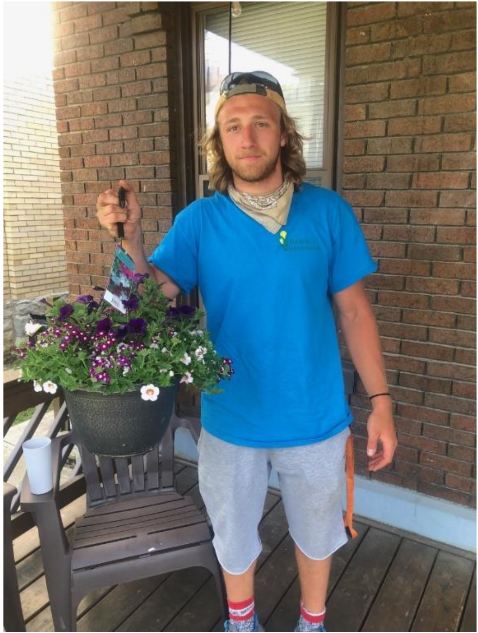
Posing in the field with a petunia hanging basket