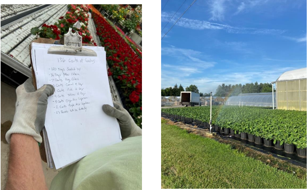
Viewing a pick list and supervising the sprinklers

The pay was $14 an hour plus 1.5x for overtime!