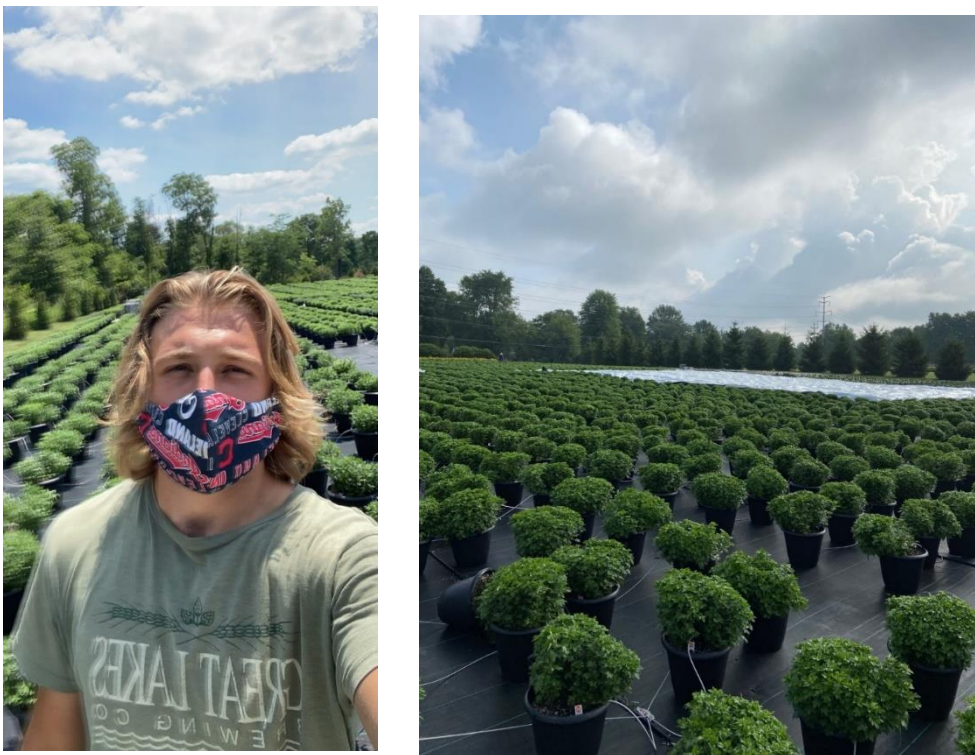
Posing in the field with Chrysanthemums

On a weekly basis we had to check the lines a few times to ensure the water was getting to the plants.