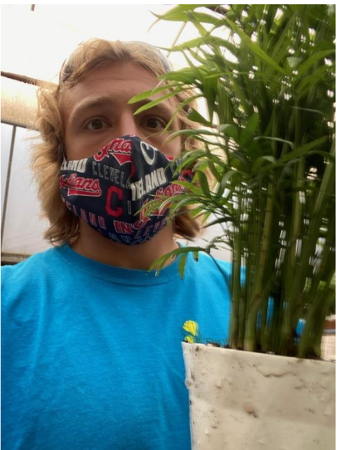
Posing in the field with a Bella Palm