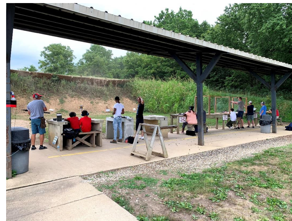
Shooters shooting at the 50-foot pistol range.