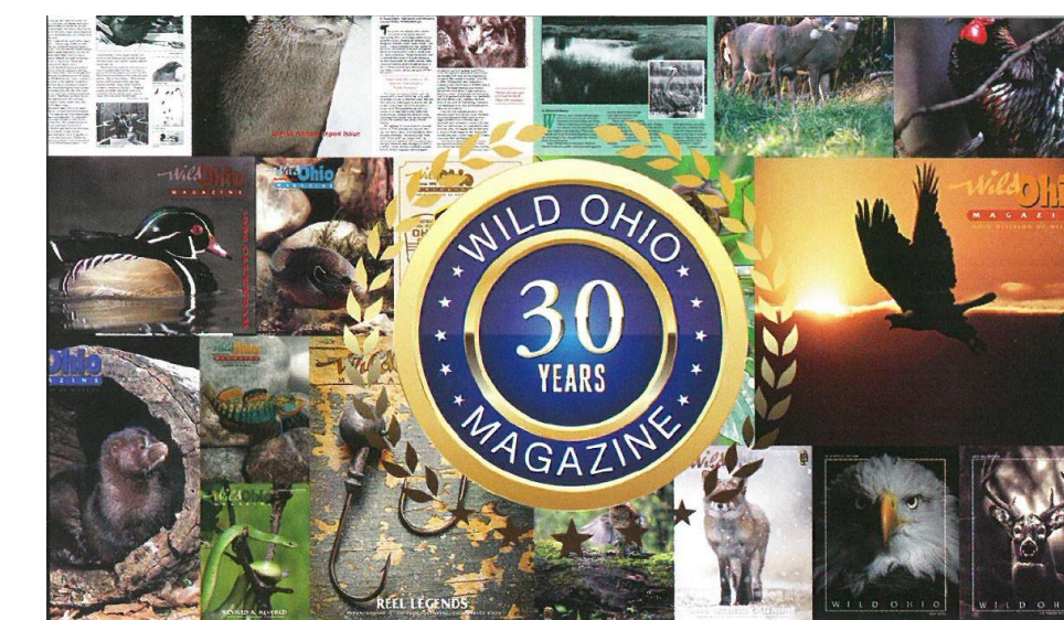
Various images of Wild Ohio magazine covers.

I would recommend an internship to with the Division of Wildlife to anyone looking for a career in the environmental field, especially if they want to work with wildlife conservation. There are many experienced and knowledgeable individuals in law enforcement, wildlife management, fish management, and information and education that a young college student can learn from. Taking an internship with the Division of Wildlife is a great step to creating a future with this Division or any other divisions under the Ohio Division of Wildlife.