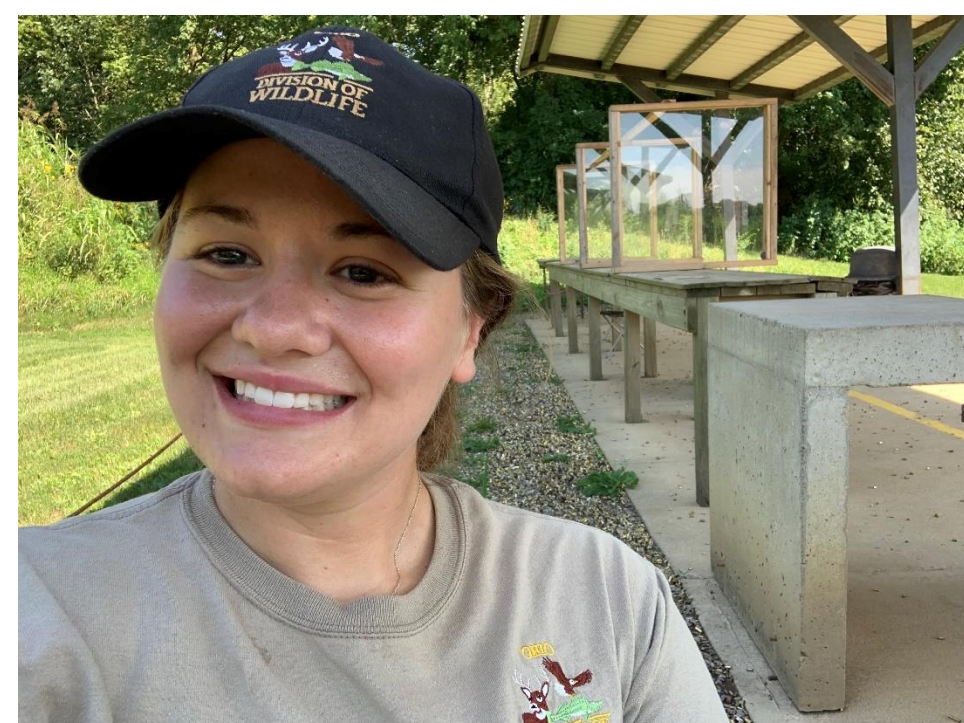
Cleaning up the pistol range at the end of the day.