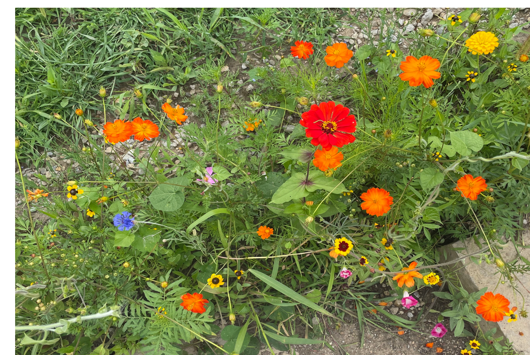
Native plants we encouraged homeowners to purchase.