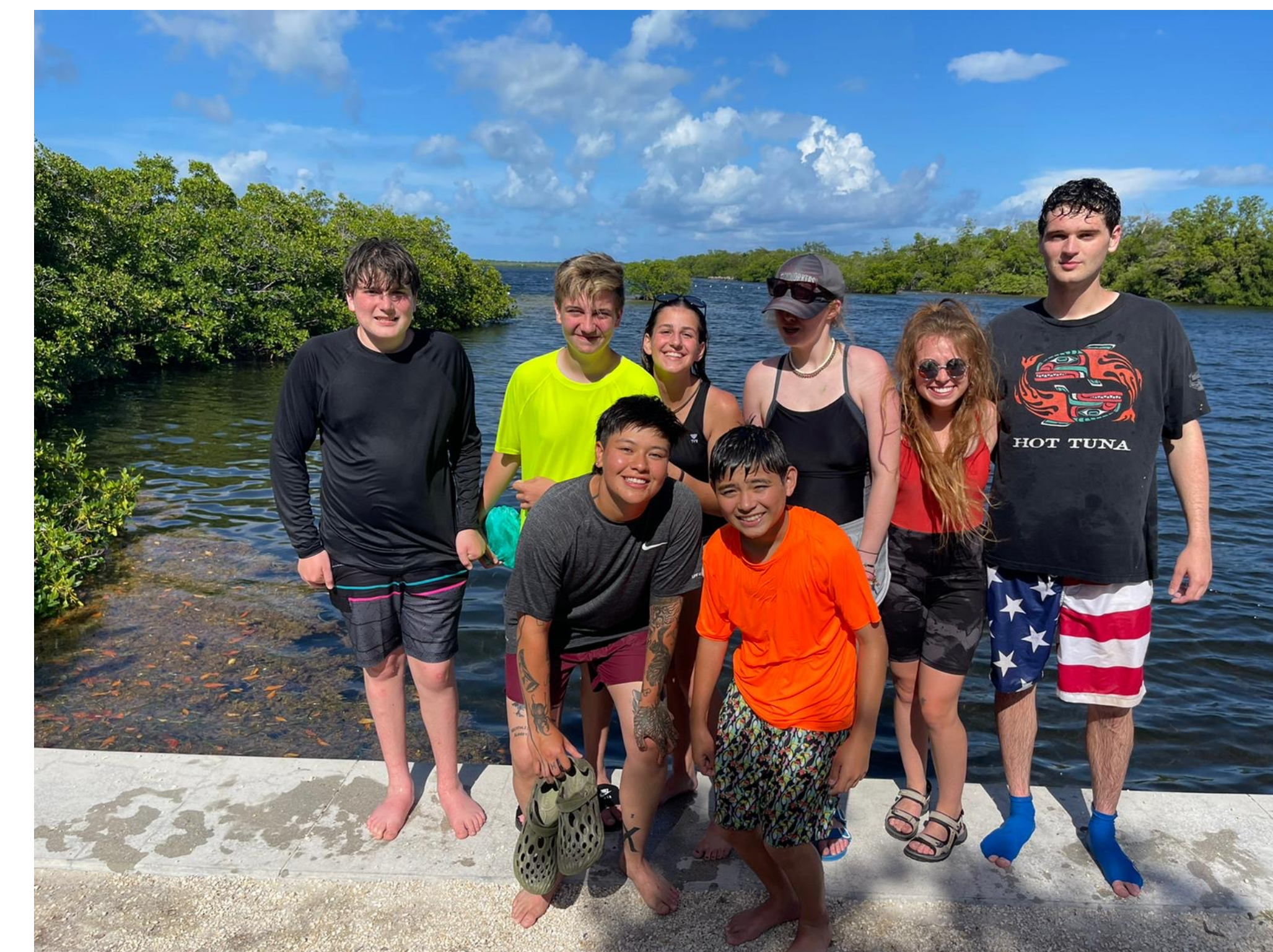
Students and myself post-snorkel in Florida