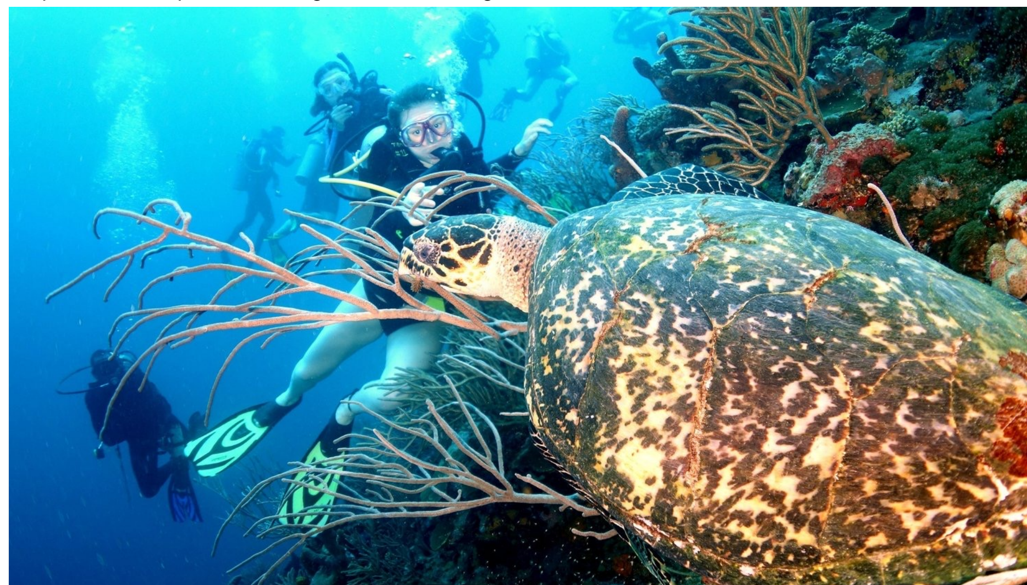
Sprout student pictured during SCUBA in Tobago.