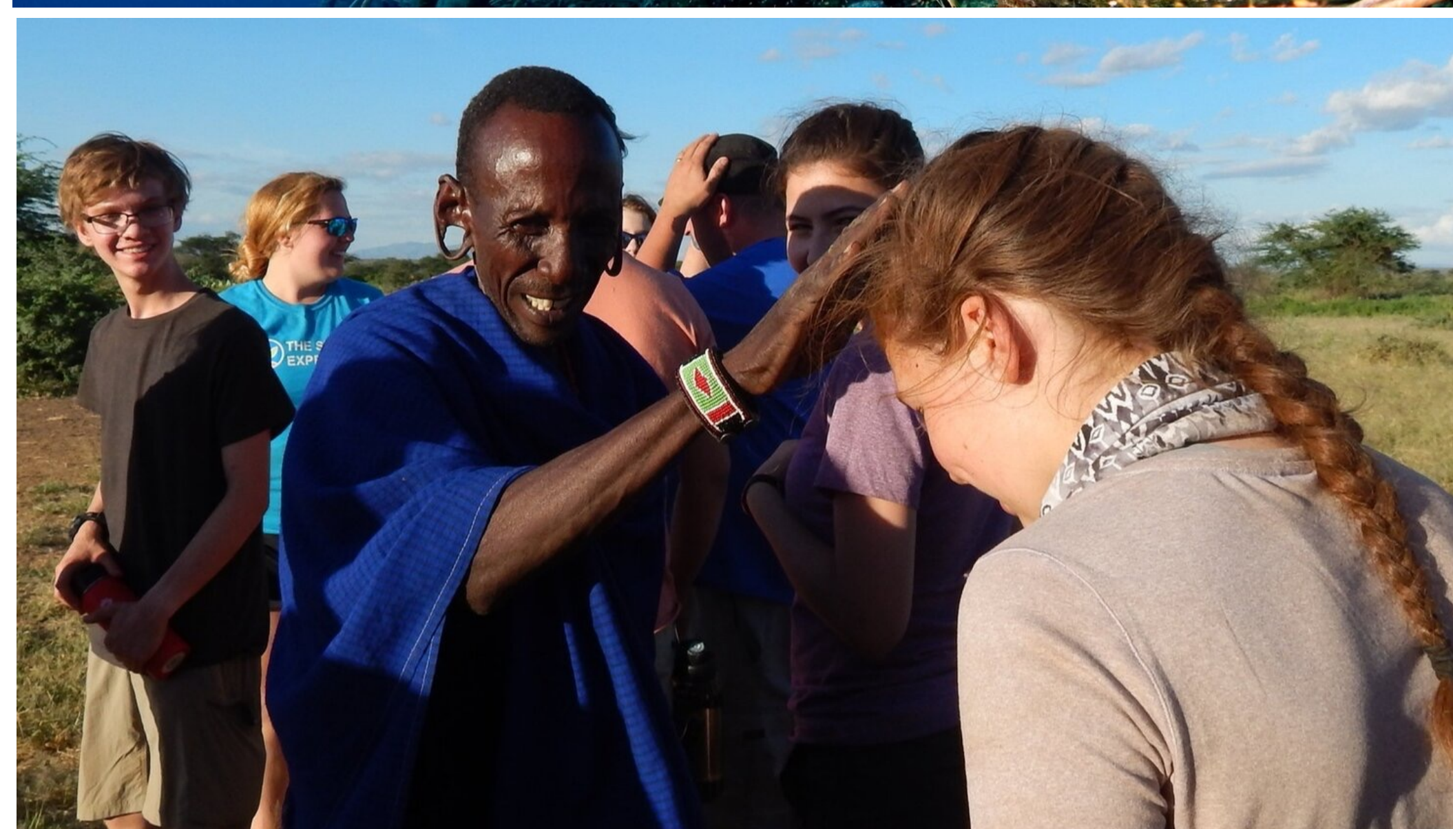
Sprout pictured with local Maasai in Kenya