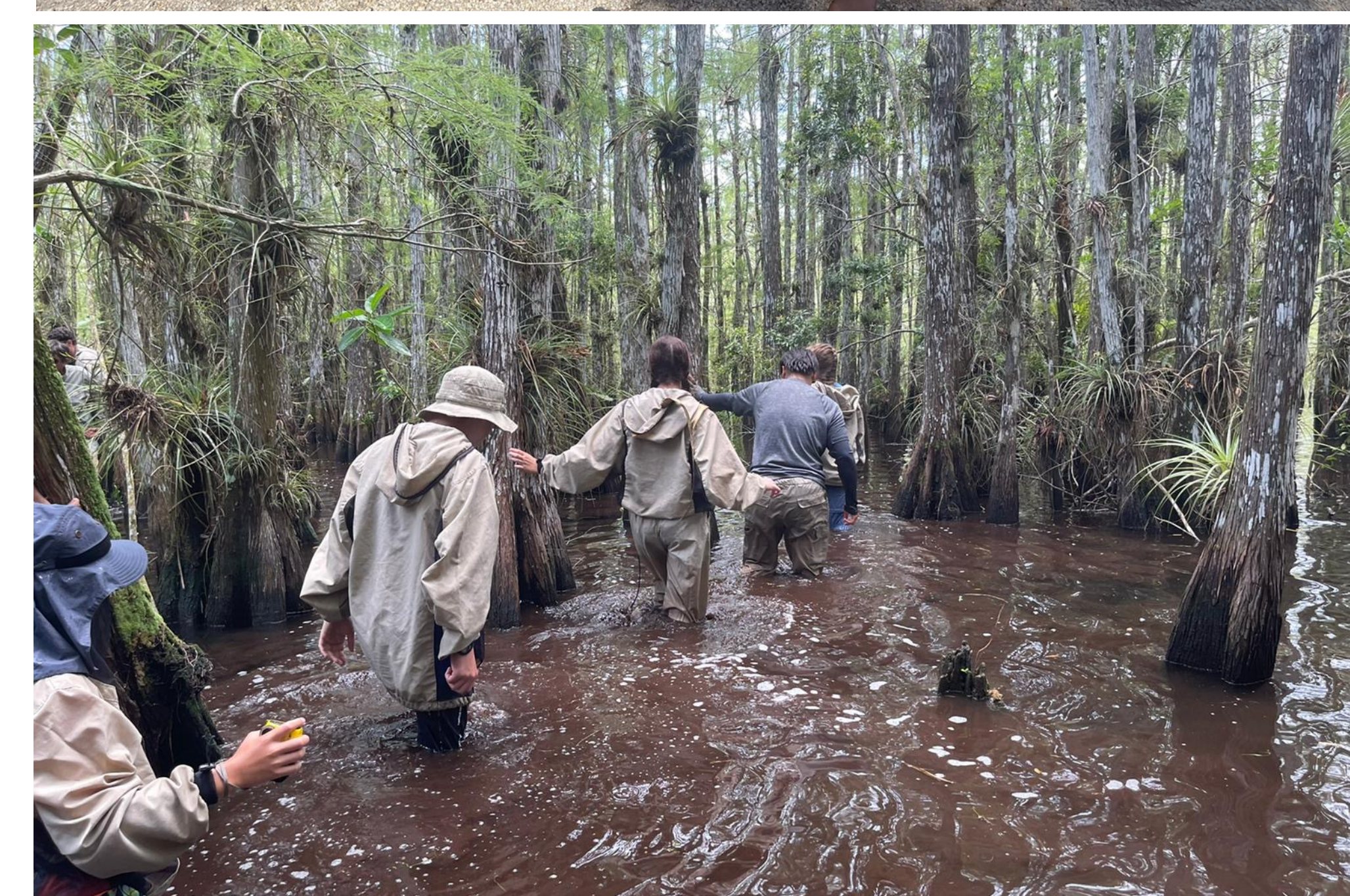
Students and myself slogging in the Everglades