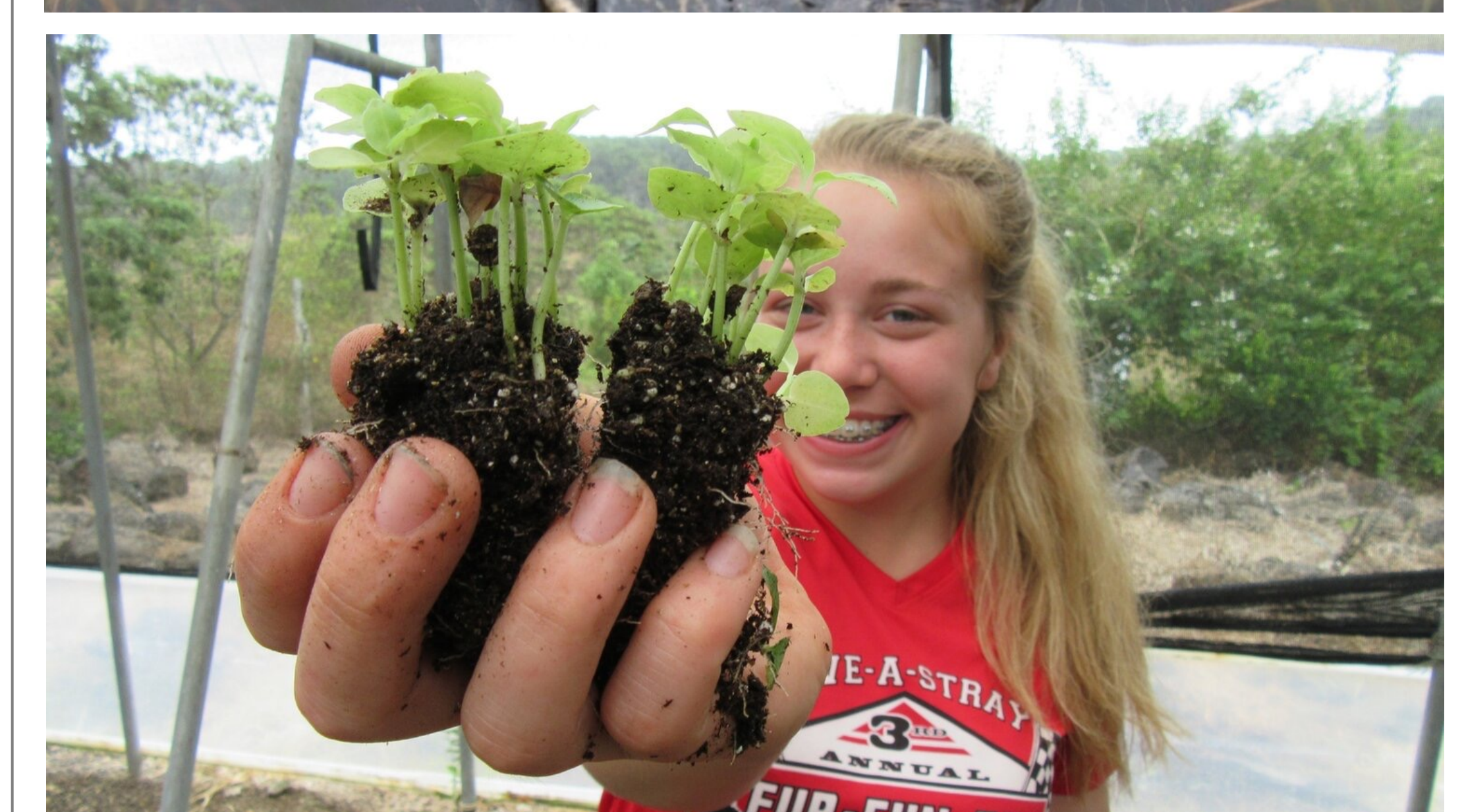
Sprout student posing in the Galapagos Islands