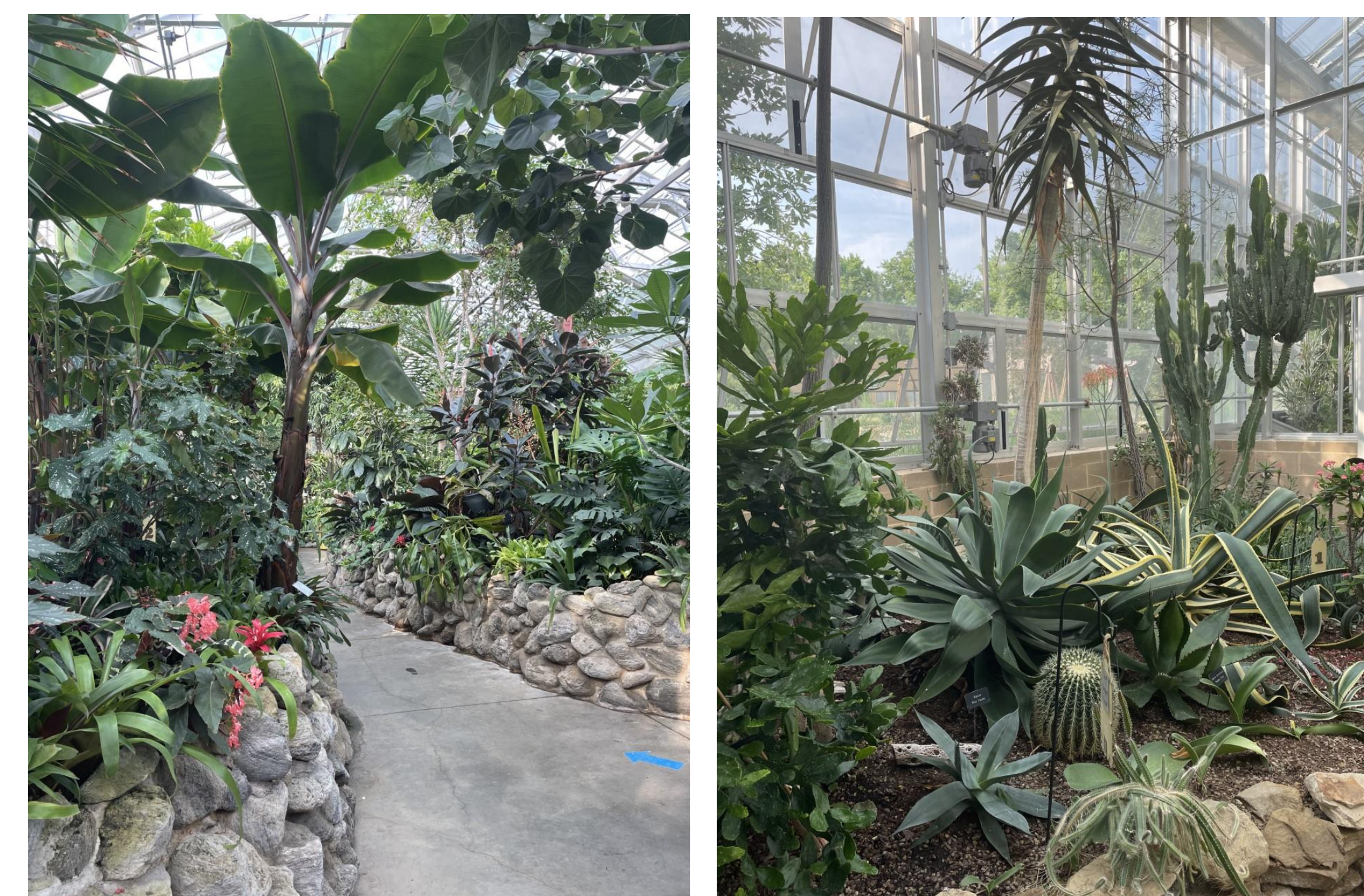
The picture on the left is in the tropical portion of the conservatory, you can see a banana tree, bromeliads, monstera and rubber plant in the background. The picture on the right is in the arid room of the conservatory, you can see multiple different cacti specimen. This is just a snapshot of the conservatory, there is much more to see!