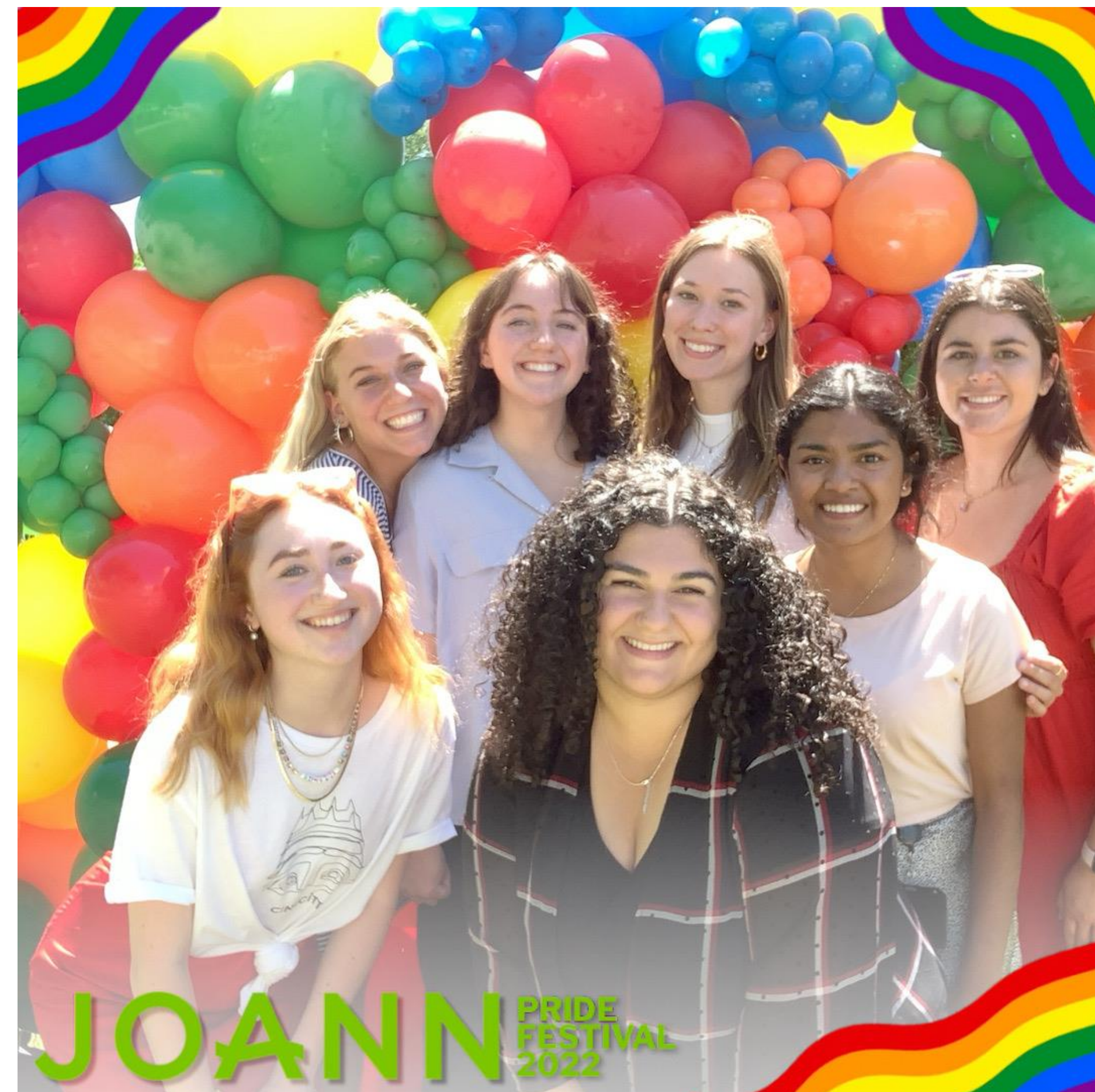
Pictured: JOANN held a pride festival for employees to celebrate pride month in June. They had a fun photo booth where a few other interns and I took this photo.

The company's mission statement was integral to my work in the Corporate Responsibility department. Part of JOANN's business strategy was to weave this idea into each of their endeavors.