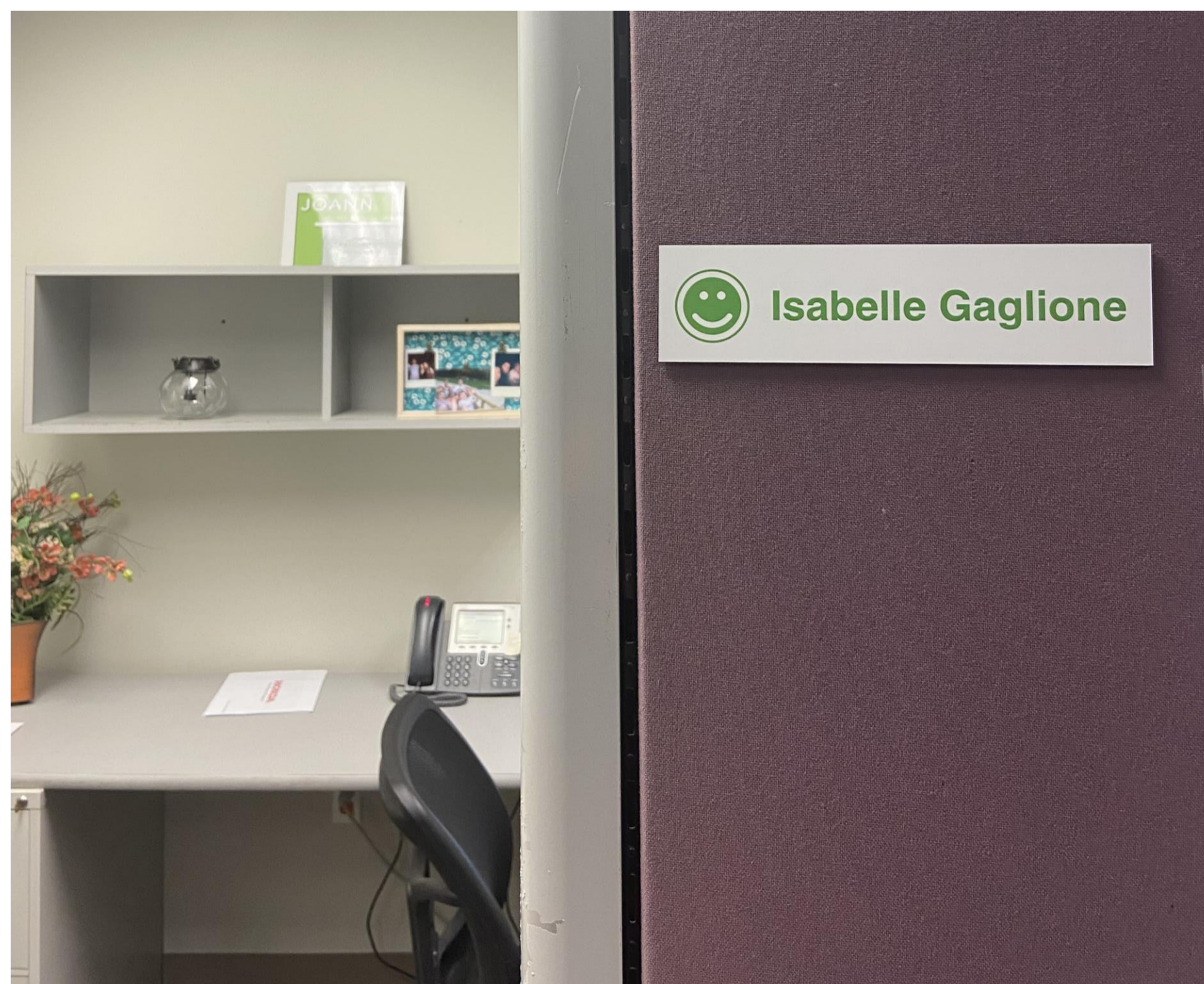
Pictured: My nameplate and cubicle at JOANN's corporate office.

JOANN has an internship program that runs every summer. They accept around ~25-30 interns that are each placed in a different department within the company. The internship program is project-based, meaning each intern is given a project to work on throughout the summer, then present to the company at the end of the internship