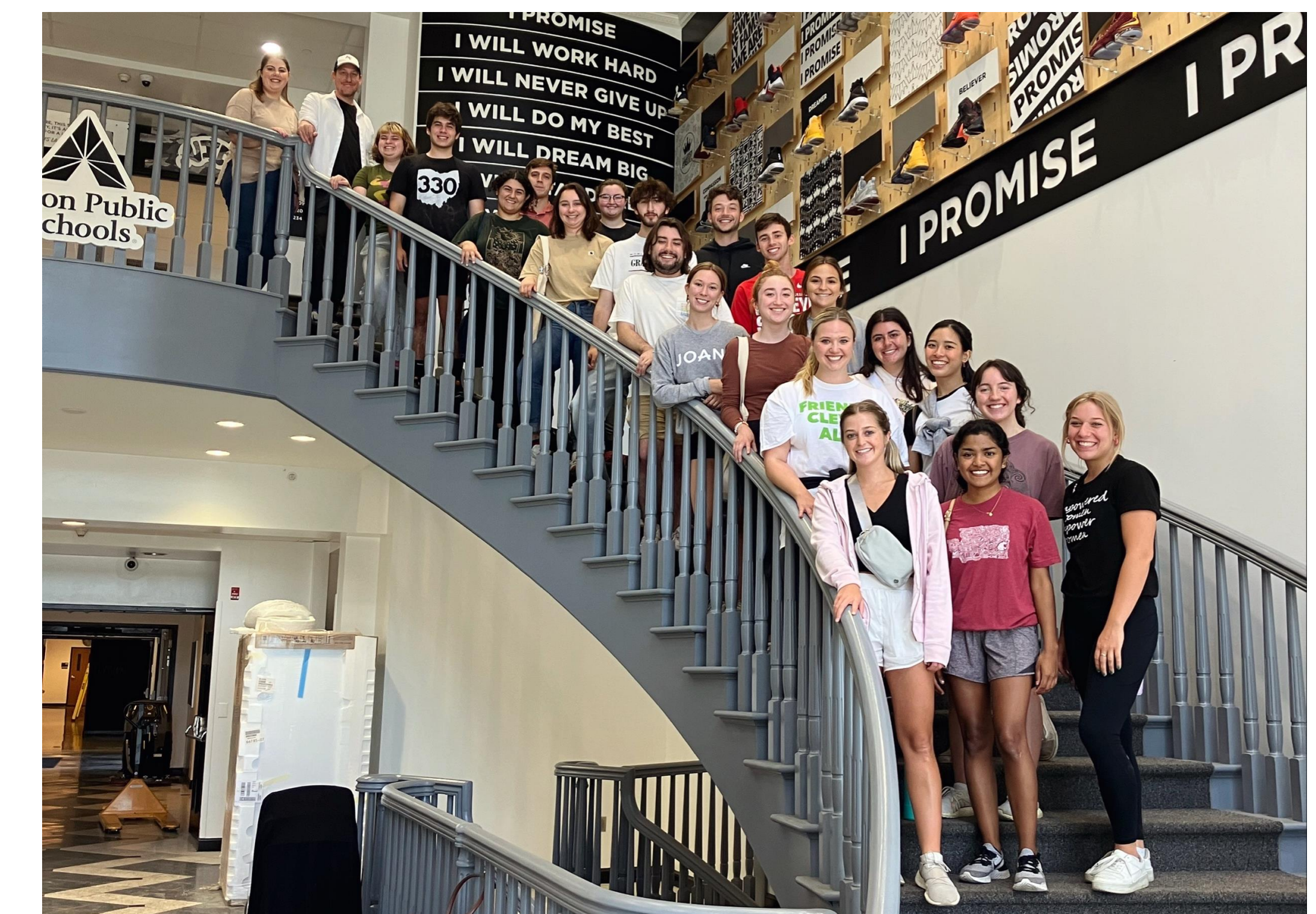
Pictured: As part of the internship program, the interns all participated in a volunteer event at the Lebron James Foundations "House Three Thirty"