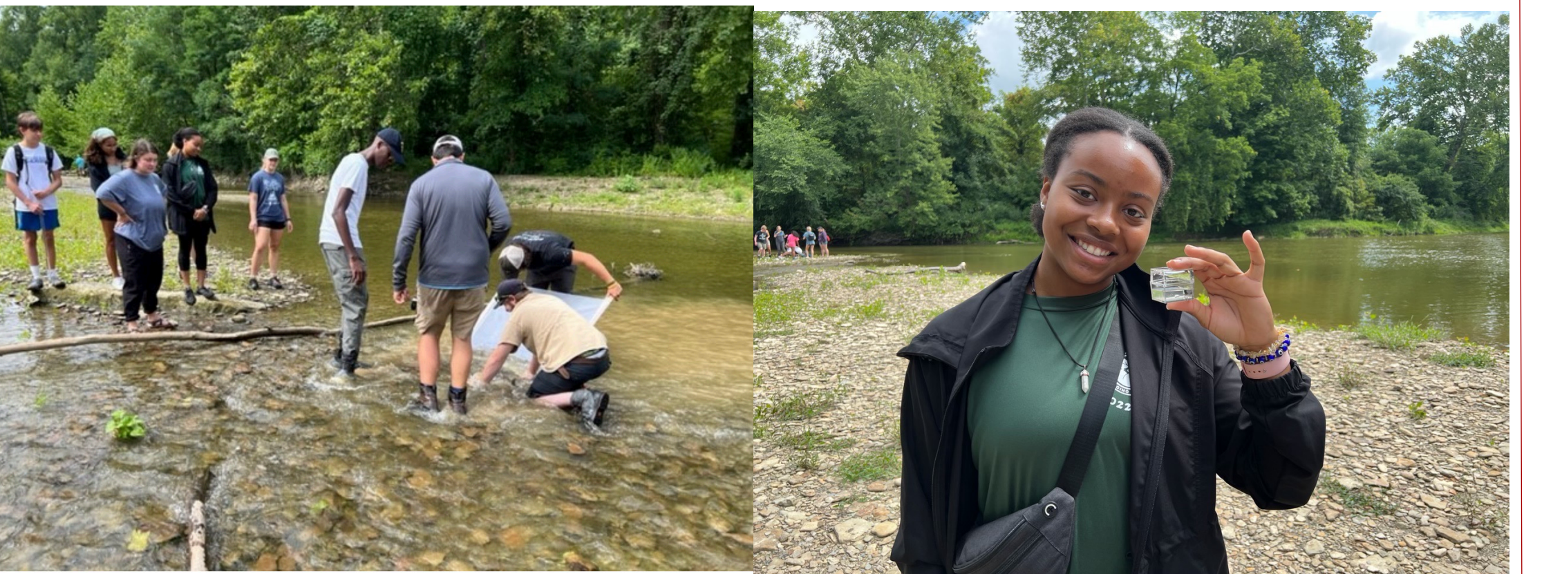
Stream Quality testing in the Grand River with the new members of the Conservation Teen Advisory Council (ConTAC) along with Ohio’s Scenic Rivers Program.

I supervised the intake process and reviewed applications for The Conservation Teen Advisory Council (ConTAC). I provided unique opportunities for high school student-leaders from diverse backgrounds across Ohio to collaborate and contribute ideas that enhance ODNR’s youth outreach and program efforts.