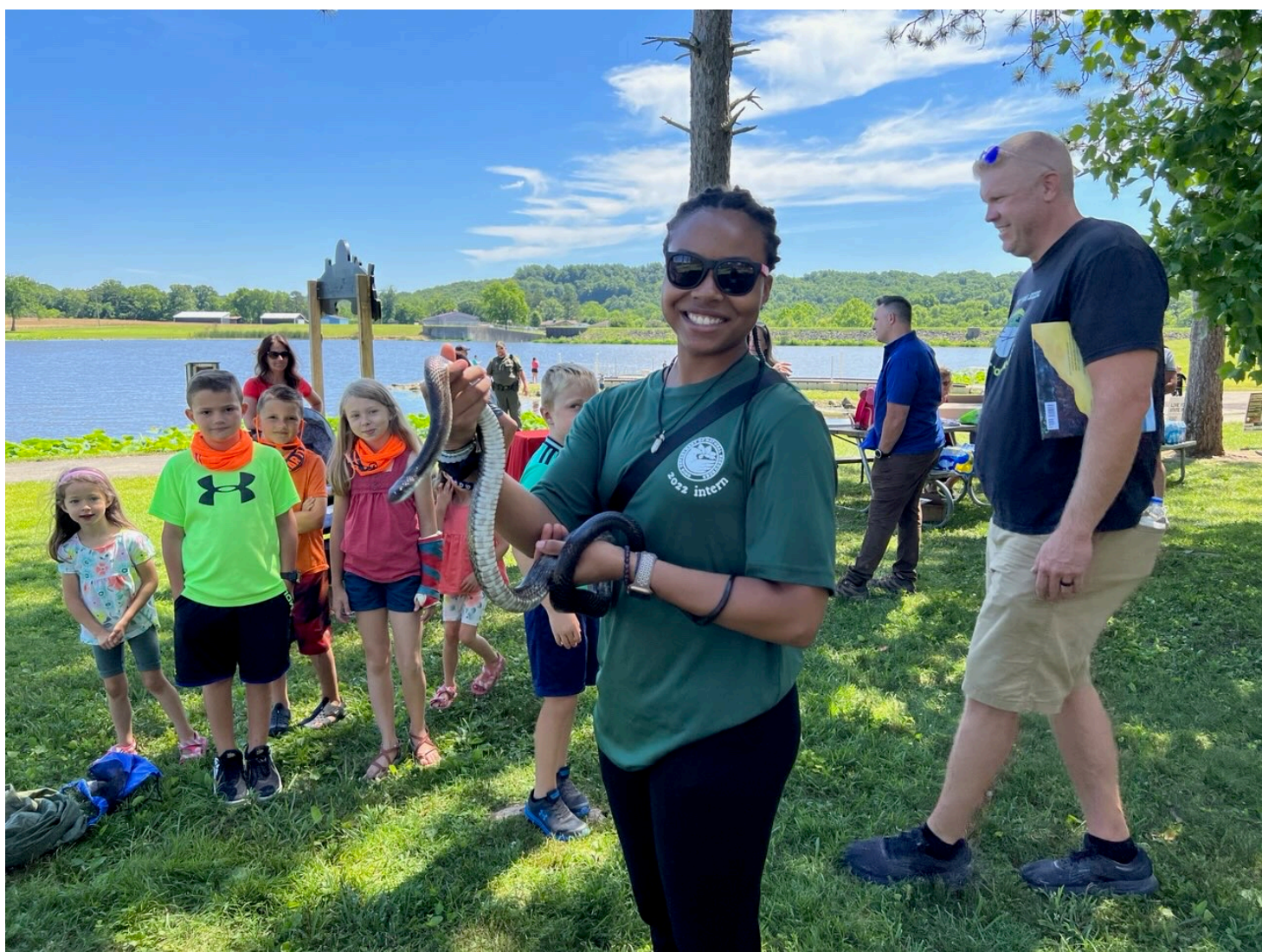
I am showing a Black Rat snake to a group of children at Adams Lake State Park.

My experience as a Special Projects Intern with ODNR has allowed me to expand on my passion of providing environmental education that gives individuals the opportunity to form a relationship with nature. I am unsure what my future career looks like, but one of the most rewarding benefits I received from this internship is exposure to the diverse job opportunities existing in the environmental field.