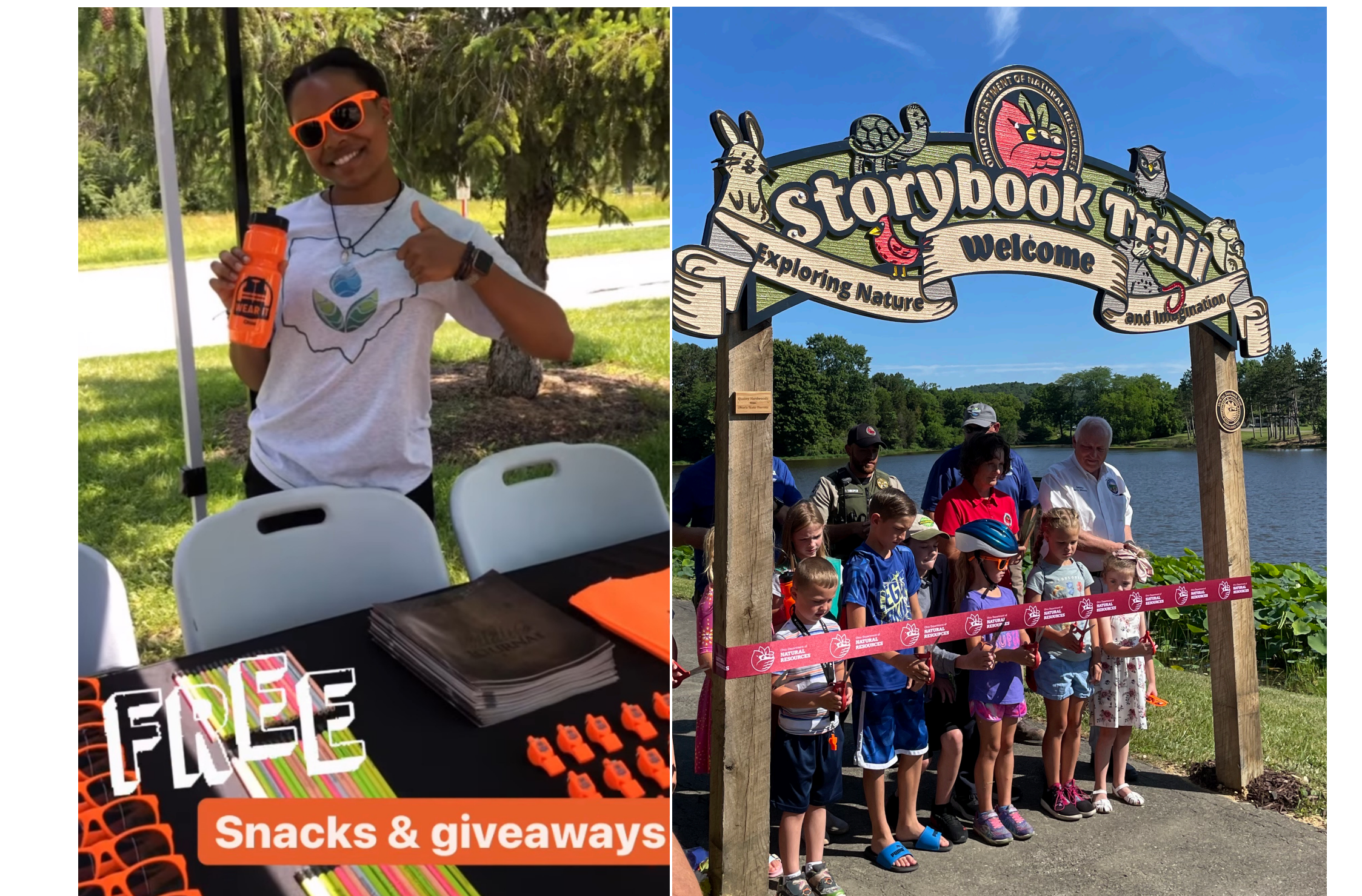
At the Storybook Trail opening for Adams Lake State Park, I engaged with families as we walked the new trail and read the story.

I educated children on the importance of literacy and having a connection with nature through my collaboration with park managers, naturalists, and other ODNR divisions on the Storybook Trail Program.