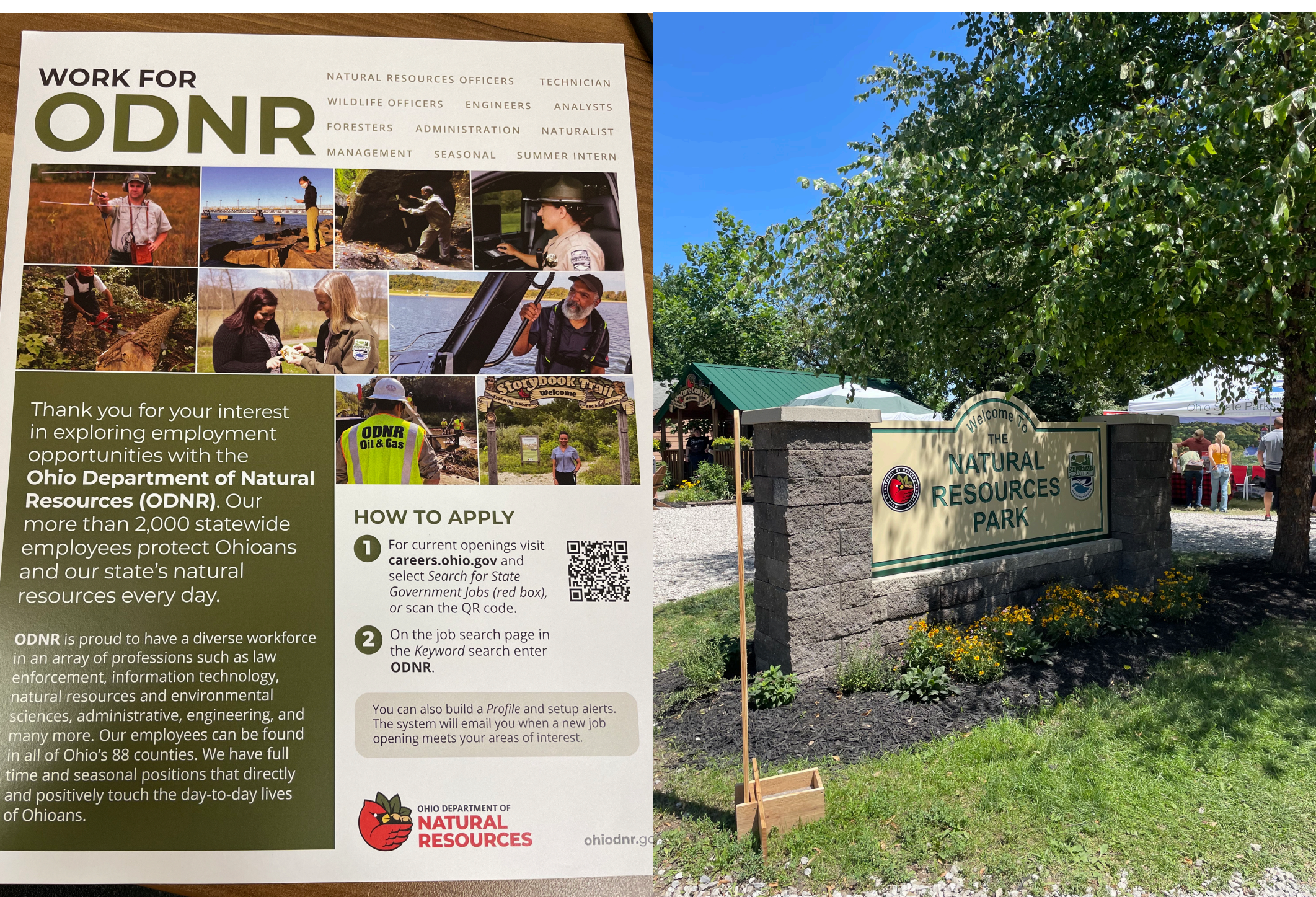
I was featured on posters and flyers displayed throughout the Natural Recourses Park during the 2022 Ohio State Fair! (My Picture is on the bottom right corner of the flyer)