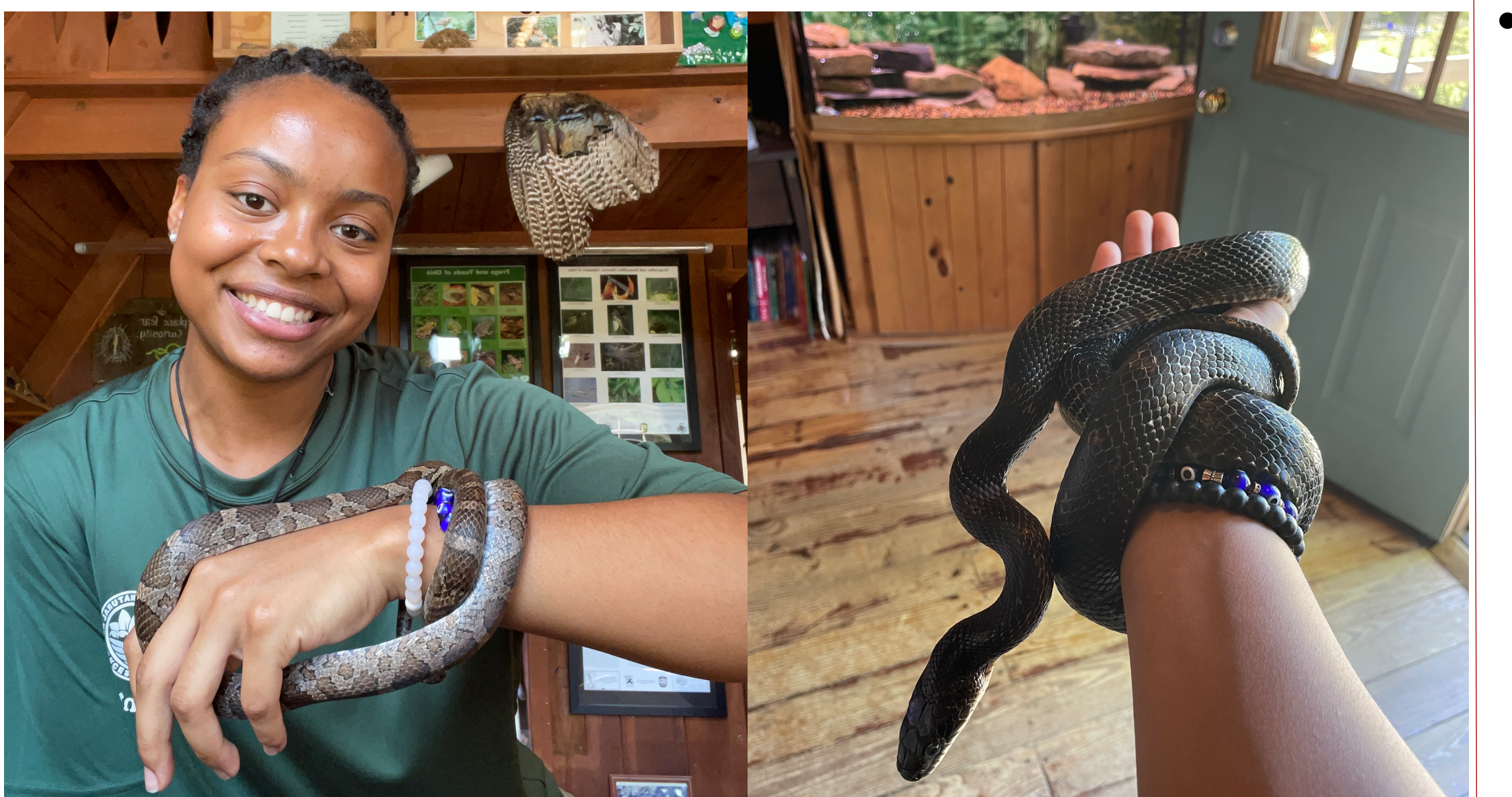
I showed a Milk snake and Black Rat snake to families visiting the Shawnee State Park Nature Center.

While aiding a naturalist at Shawnee State Park, I used my classroom knowledge to educate families visiting the nature center on the importance of protecting our natural world with the help of the animals in the nature center.