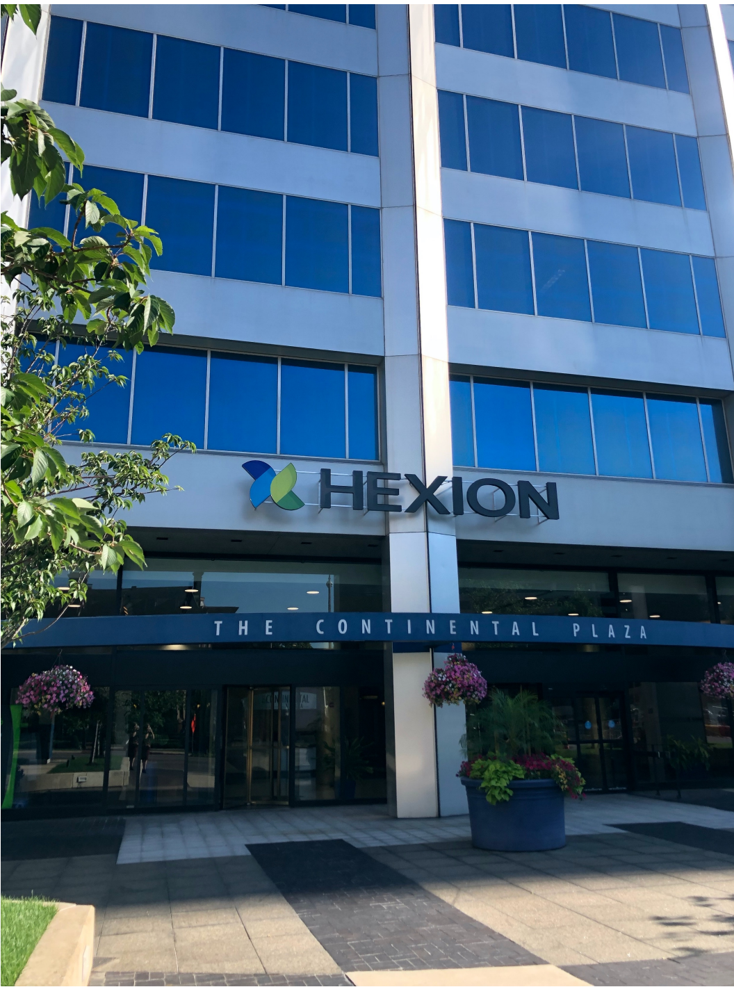
Hexion Headquarters in Columbus, Ohio

My experience at Hexion gave me firsthand insights on what it is like to work in the sustainability field on a corporate level. I plan to reach out to Hexion and similar companies leading up to my graduation from Ohio State in May 2022. I will seek another job in the corporate sustainability field as they arise; I found the experience to be quite rewarding and interesting.