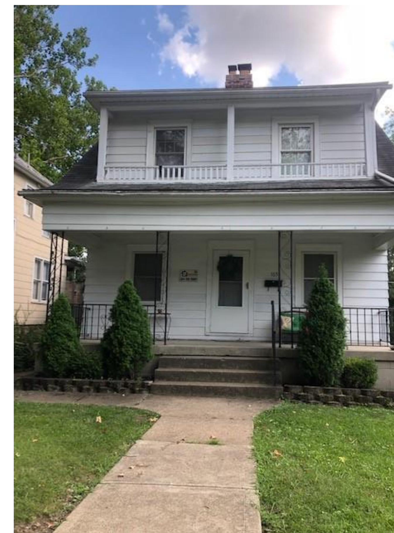
As we did property walkthroughs on houses such as this one, we were checking for things such as mold and working fire alarms, among other things that make a house safe to live in.