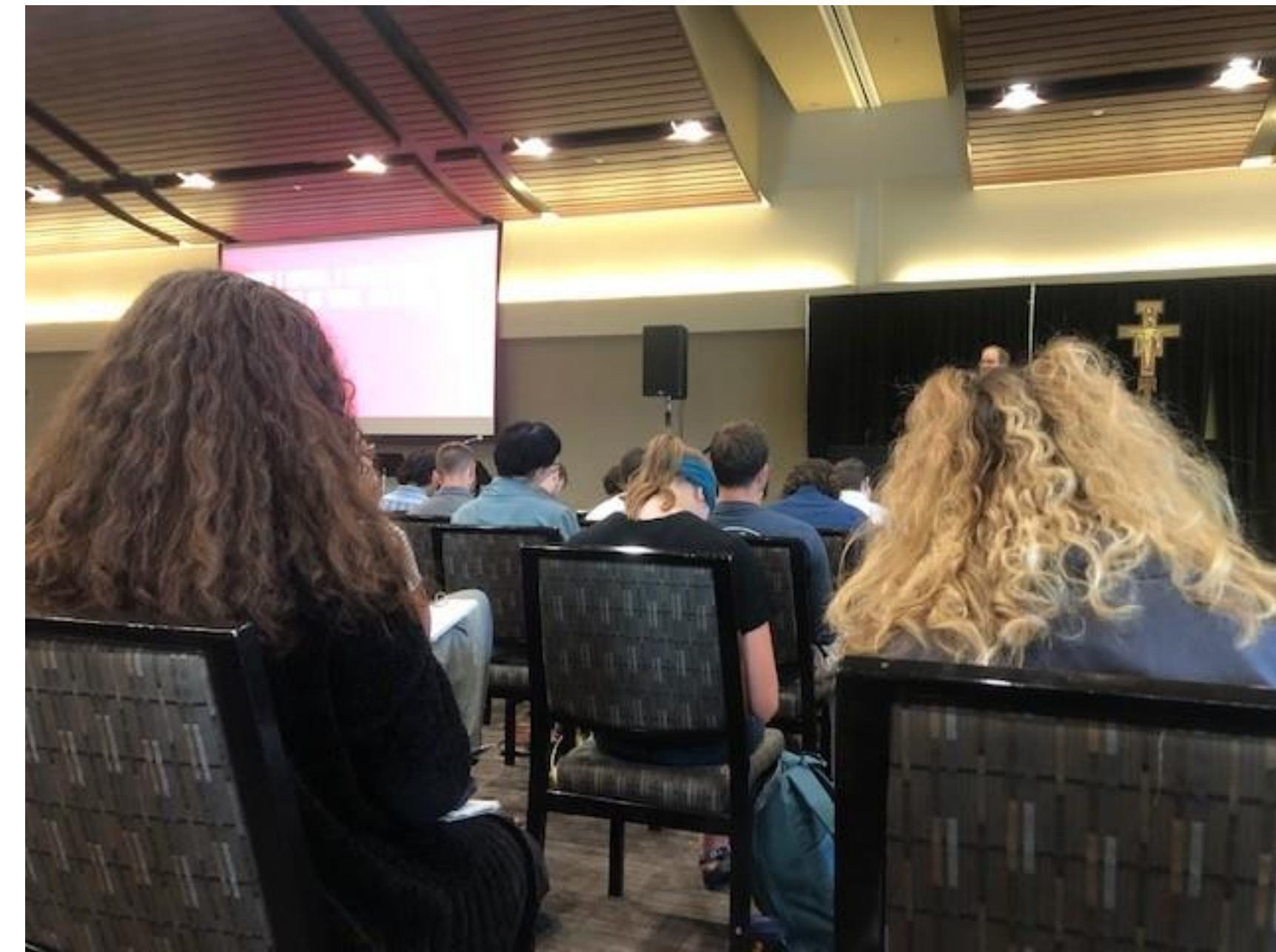
While in missionary training, we had content sessions in a large event space, learning about things like mental illnesses and resources that are helpful if we see someone who is struggling.