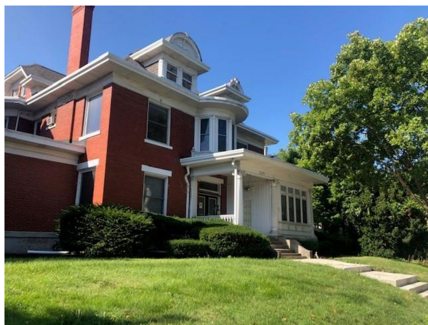
The second 5 weeks of the internship were spent at the regional office on Broad Street in Columbus, Ohio