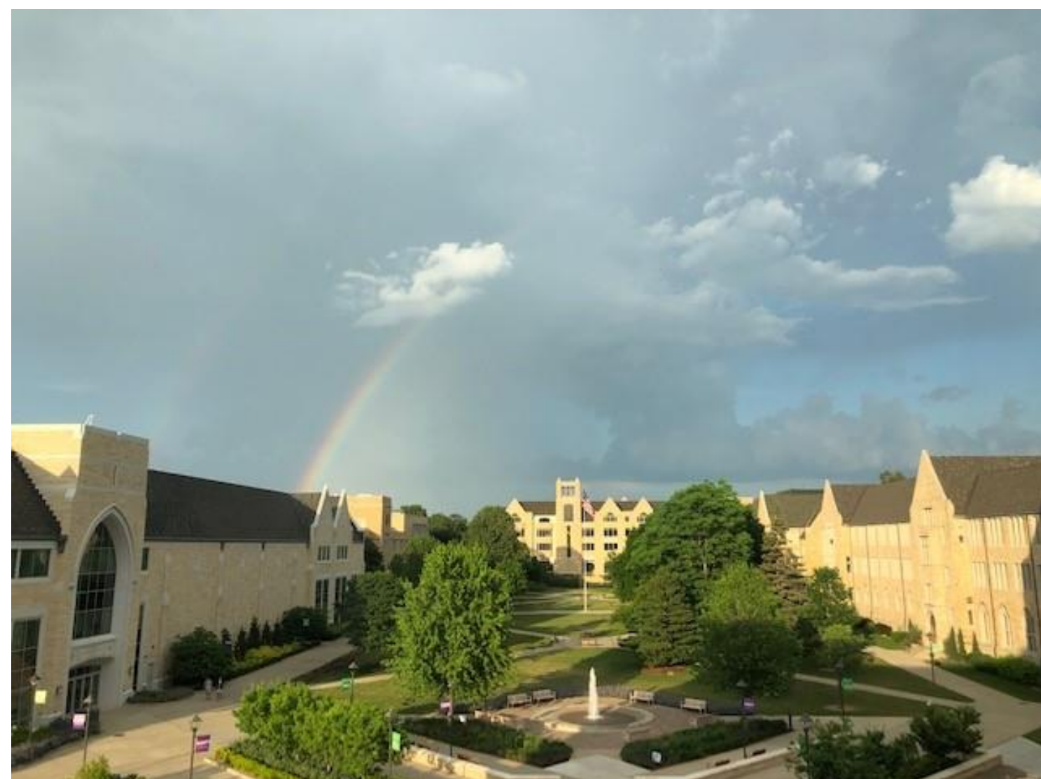
The first five-weeks of the internship were spent at the University of St. Thomas in St. Paul, Minnesota

Being involved with the SPO chapter at the Ohio State University, they asked me to consider an internship with them. In interning with them, I was able to spend 5 weeks in the Twin cities in Minnesota as well as 5 weeks in Columbus, Ohio at the regional office.