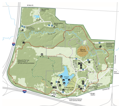
Map of Sharon Woods Metro Park

The park that my internship took place at was Sharon Woods in Westerville. The internship began in May and ended in early September.