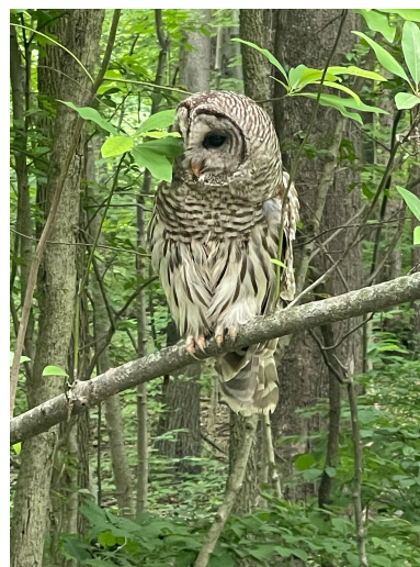
One of the five owls that can be found at Innis Wood