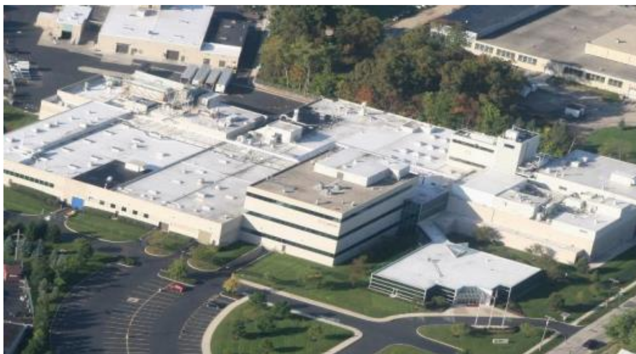
Image of present-day Marysville Nestlé R&D Center