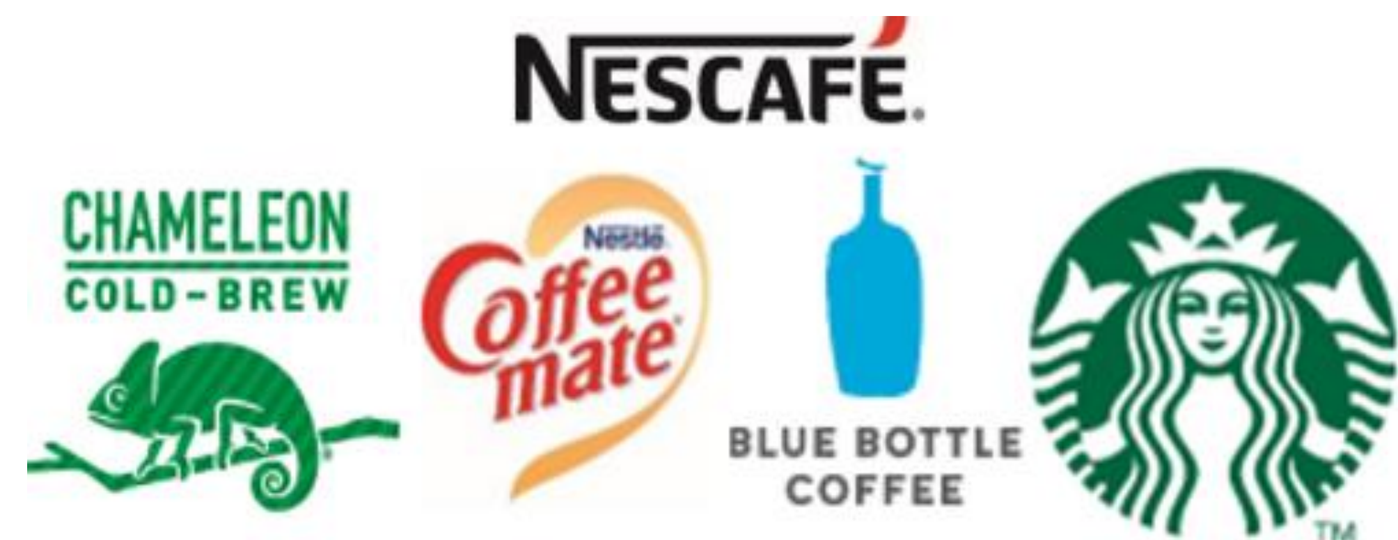
Key Coffee Brands the Facility supports in R&D functions