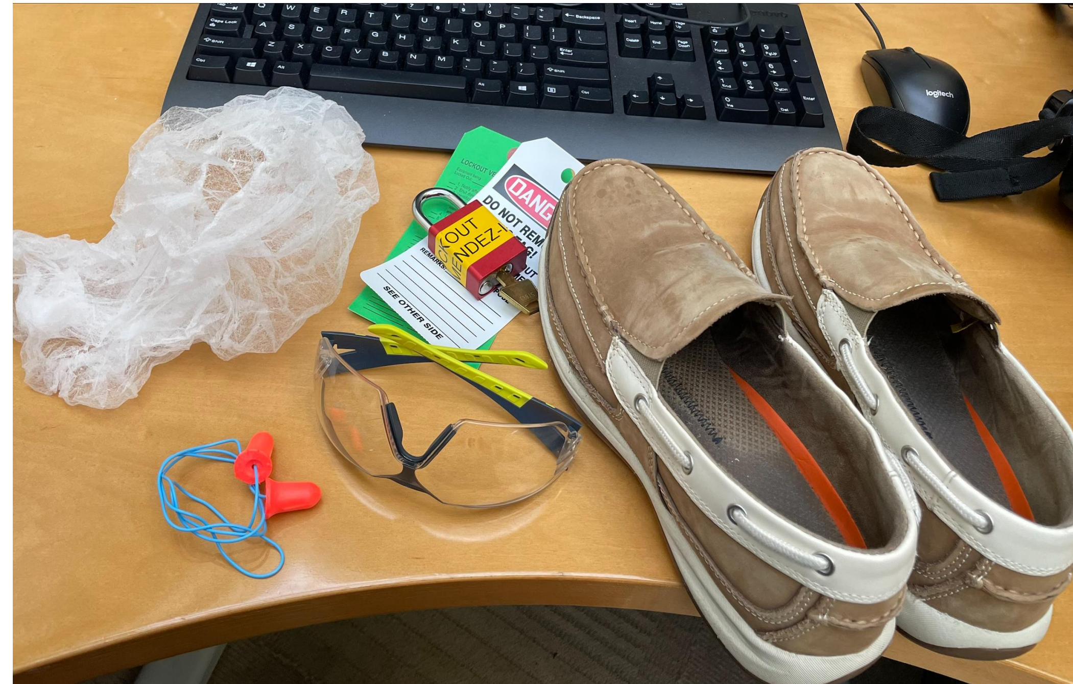
My everyday PPE- steel toed shoes, safety glasses, earplugs, hairnet and LOTO tags/locks