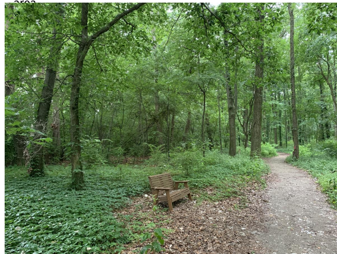
One of the trails that passed through the woods.

Most of the summer we worked on thinning out the woods of unwanted trees and shrubs. And helped gain canopy space for desired species of trees.