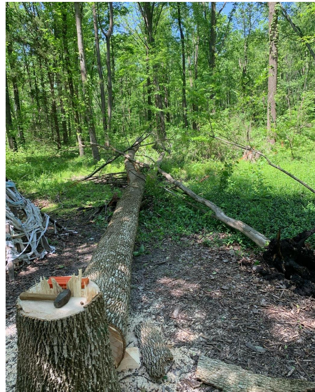
A dead green ash tree too close to the children's nature play area.

The effect of the emerald ash bore on the green ash within the center was extensive. A large amount of time was spent felling dead trees close to the trails.