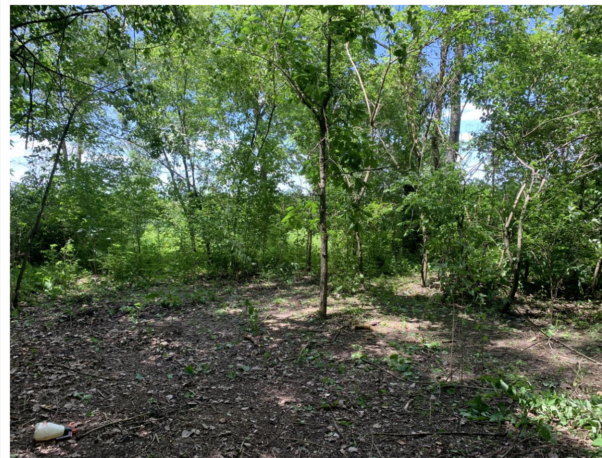
Swamp White Oak after thinning of surrounding trees.