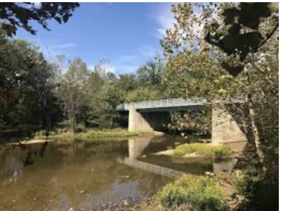
Bridge The log jam was at