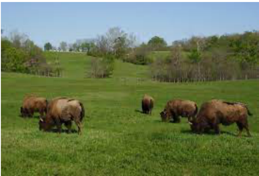
Bison in open prairie at BDC