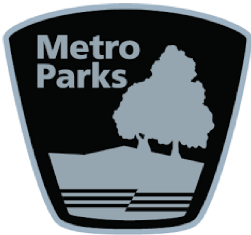
Logo of Columbus Metro Parks

I was a maintenance tech for the summer of 2021 at Battelle Darby Creek metro park. This park is located in Galloway, Ohio. I began in early May and continued my employment there until mid August. Being able to work at the metro parks is an amazing opportunity to get your foot in the door if you are interested in a job in a local park. I was lucky enough to get to select the park I worked at and chose the biggest metro park with the most to offer visitors. Learning the maintenance of a park that size brings into perspective how much it takes and gives you more of an appreciation for our local parks.