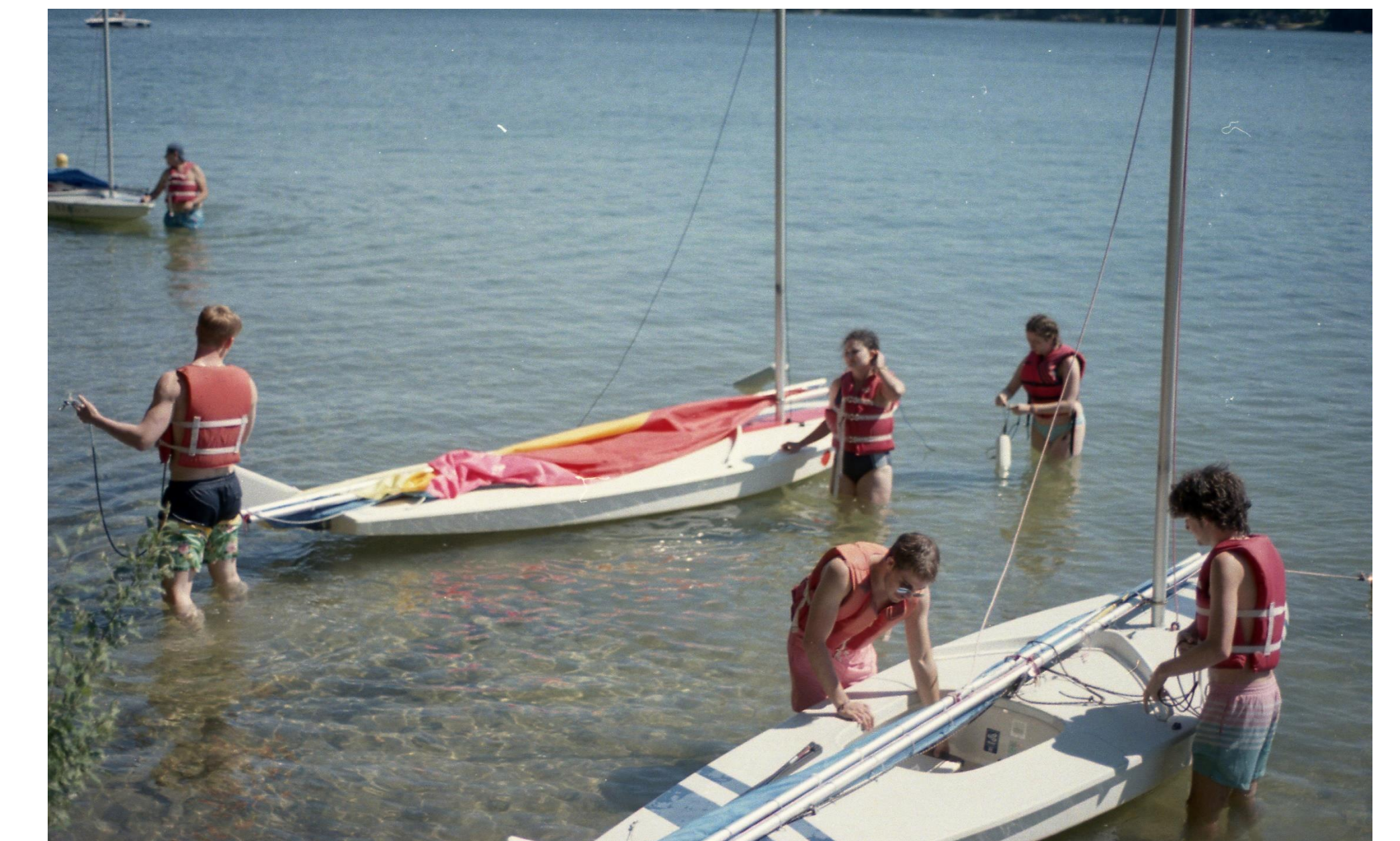
Counselors getting sailboats ready to take campers out on Long Lake

“Summer camp should be a place where kids feel safe and supported; where they develop independence and gain skills that feed their resilience and self confidence; and where they form lasting friendships and craft lifelong memories.” – Camp Walden Philosophy