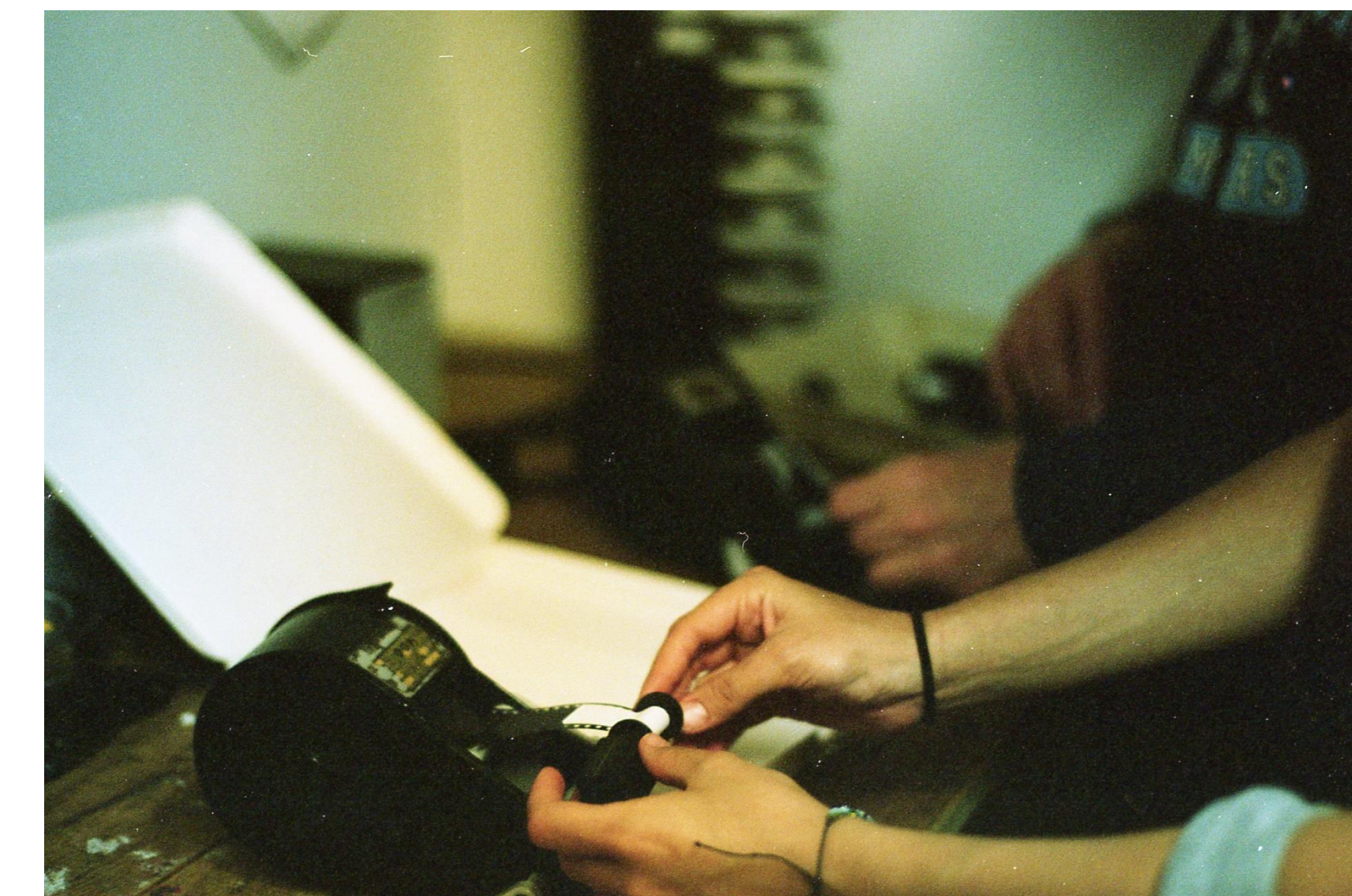
Rolling film for campers to shoot – A new skill I learned