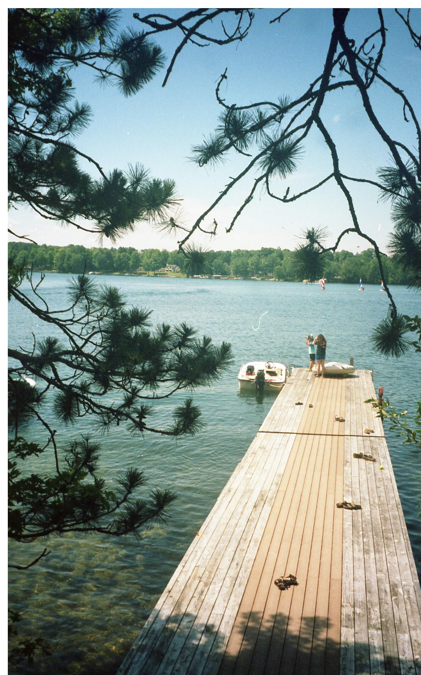
Two campers from my B&W film class shooting on a sunny day