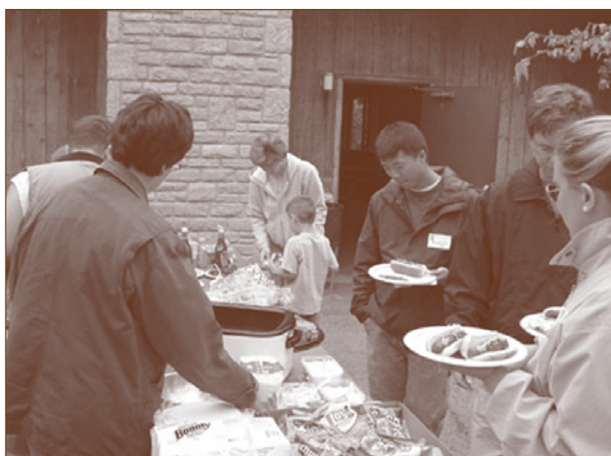
Hungry participants take a lunch break.