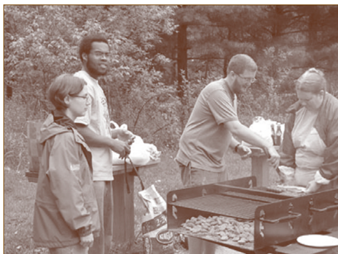
GradRoots members heat things up at the Spring Gathering.