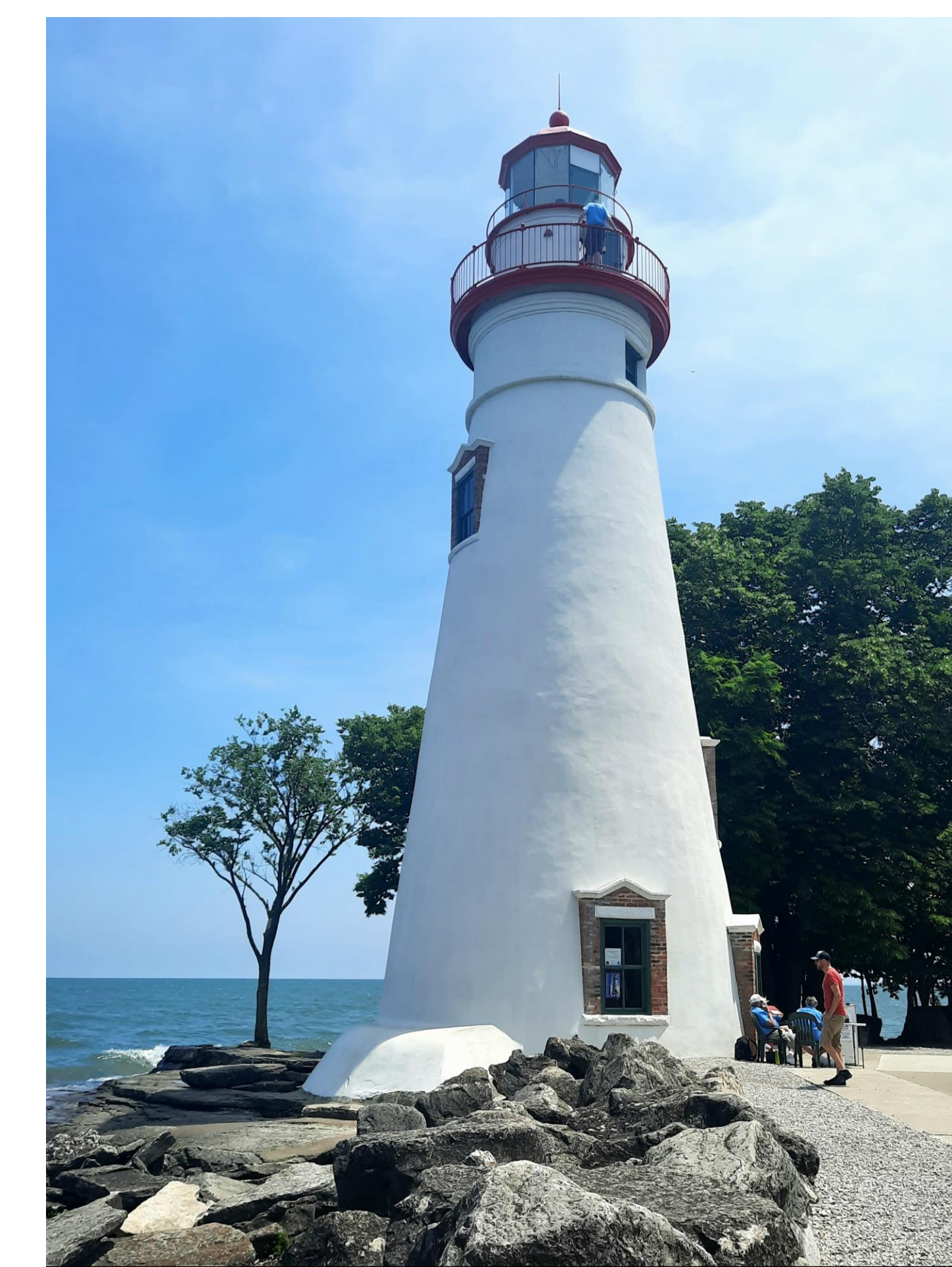
Marblehead Lighthouse State Park