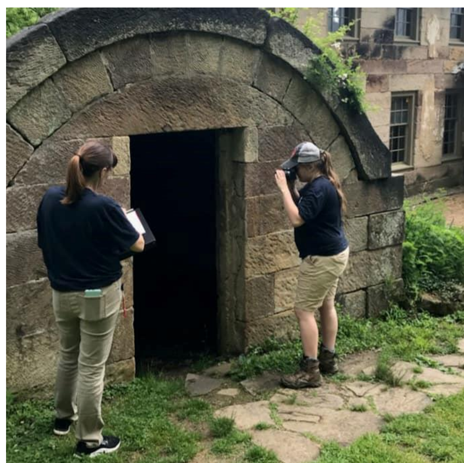
Me and a fellow intern at Salt Fork State Park