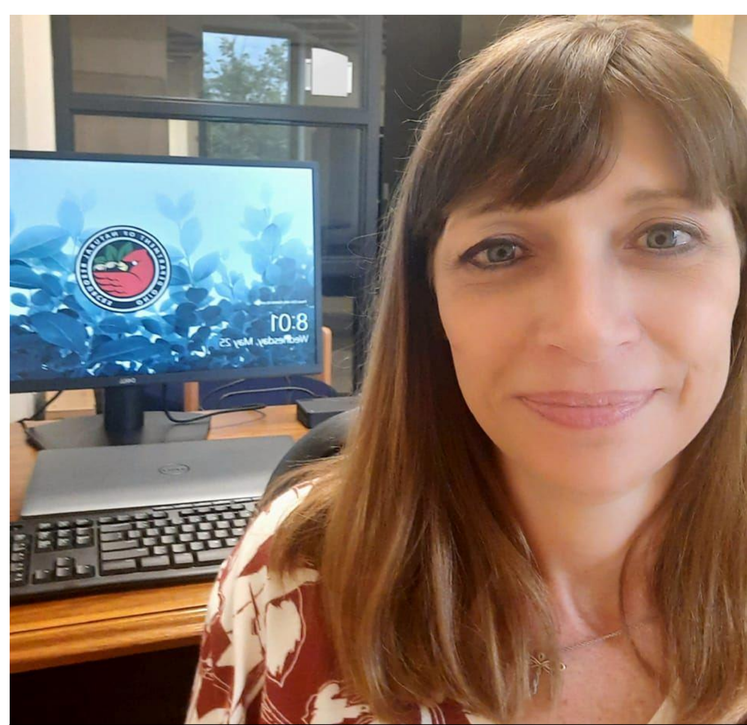
Me at my desk in my office at ODNR

I worked full-time as the Historical Resources Intern for The Ohio Department of Natural Resources (ODNR) over Summer break of 2022 and I am currently working as a part-time Intern for the remainder of the 22/23 school year.