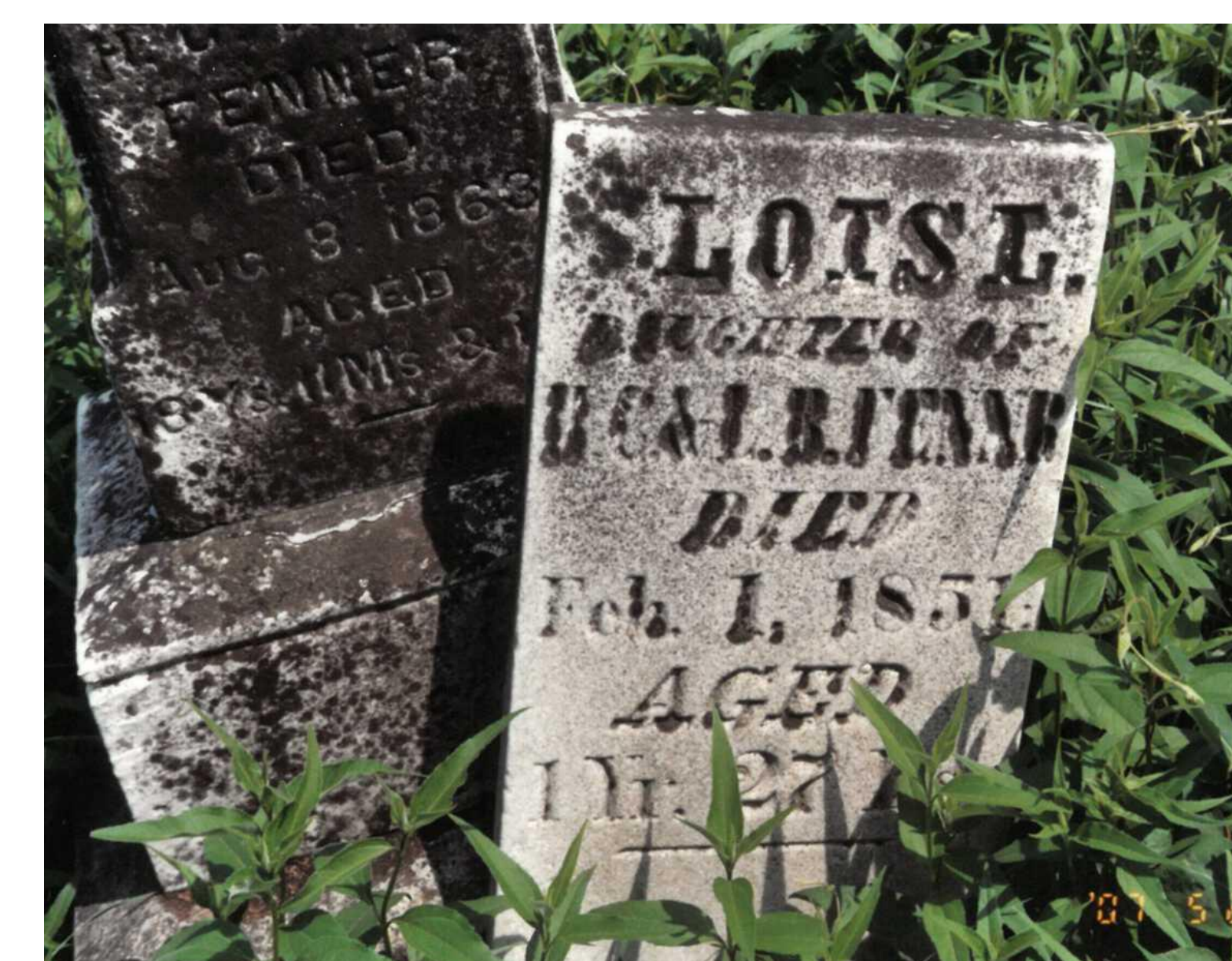
Tombstones at Bigelow Historical Cemetery and State Nature Preserve

ODNR employs the best of the best. The hiring process can feel very slow but don't give up. The staff is amazing. The opportunities are endless.