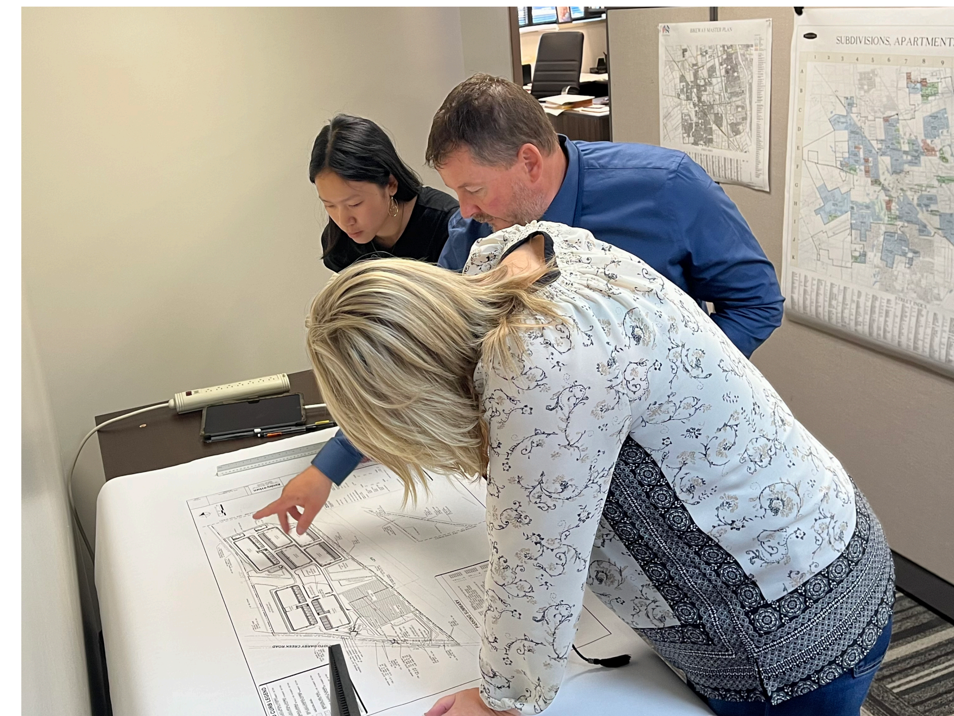
Image of me working alongside Hilliard's Planning Manager and Code Enforcement Officer to review the site plan of a new development proposal.