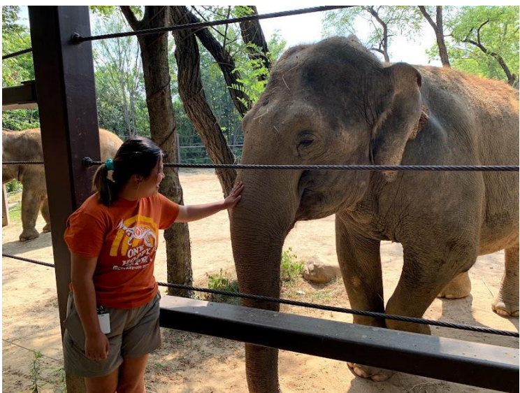
Other animals I worked in proximity with, including Mai Tai the elephant, Moe the sloth, and Fiona the hippo

This internship solidified my career goals of being able to work with both children and wildlife. I love sharing the joy of nature and conservation with kids and watching them apply knowledge that I have taught them. I would love to go back to work at the Cincinnati Zoo & Botanical Garden in the future, perhaps as a camp instructor, but I would likely not do another internship there as I cannot afford it. Recently, I have been looking for other similar internships and children's programs around the Columbus area and hope to find something like the work I did at the Cincinnati Zoo. I would recommend this internship to those who are able to take on unpaid internships, as it was an amazing experience I will never forget.