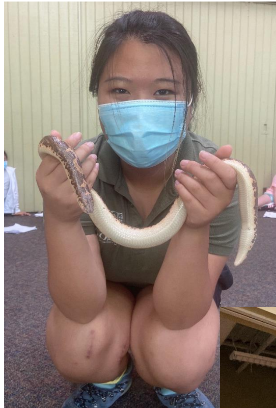
Pictures from when I was trained on handling and interpreting the Kenyan sand boa and the three-banded armadillo

During the summer of 2021, I had the chance to work as an intern in the education department of the Cincinnati Zoo & Botanical Garden located in Cincinnati, Ohio. I found this job online while looking for environmental and conservation-based jobs in Cincinnati. While this internship was unpaid, I gained a lot of connections and experience that made the internship very worth my time. The Cincinnati Zoo & Botanical Garden is dedicated to creating adventure, conveying knowledge, conserving nature, and serving the community. While the Cincinnati Zoo is for visitors, while working there I felt like that conservation of wildlife and nature was sometimes even more important than the visitors, which I really liked.